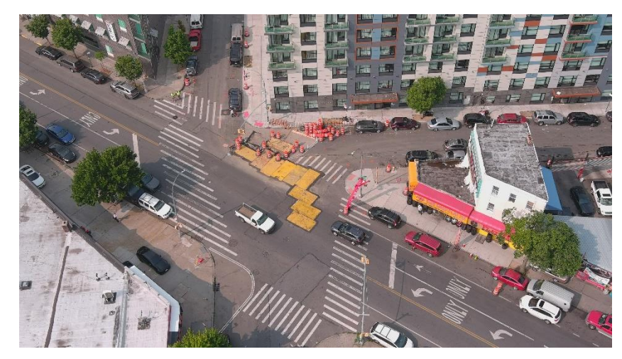
E.185<sup>th</sup> Street at 3<sup>rd</sup> / Bathgate Avenues