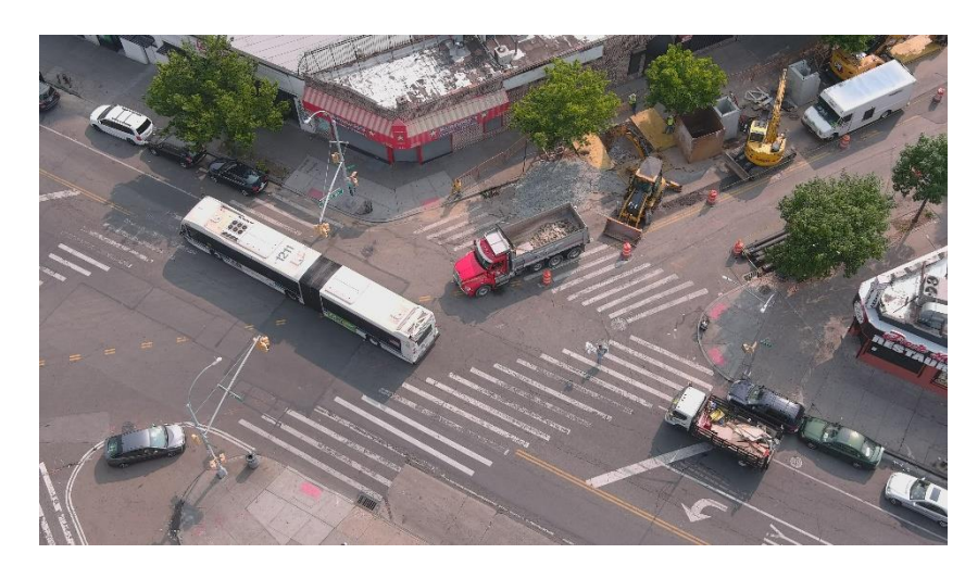
E.187<sup>th</sup> Street at 3<sup>rd</sup> / Washington Avenues