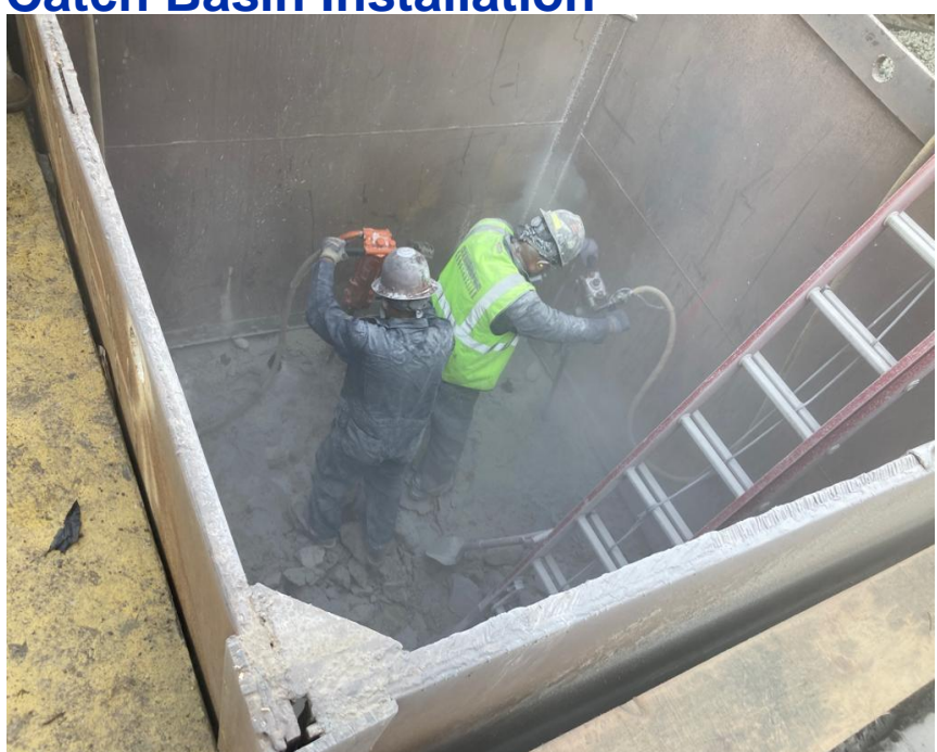
E.187<sup>th</sup> Street at 3<sup>rd</sup> Avenue