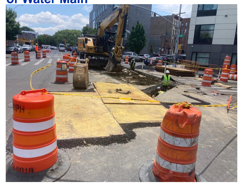
E.187<sup>th</sup> Street at 3<sup>rd</sup> Avenue