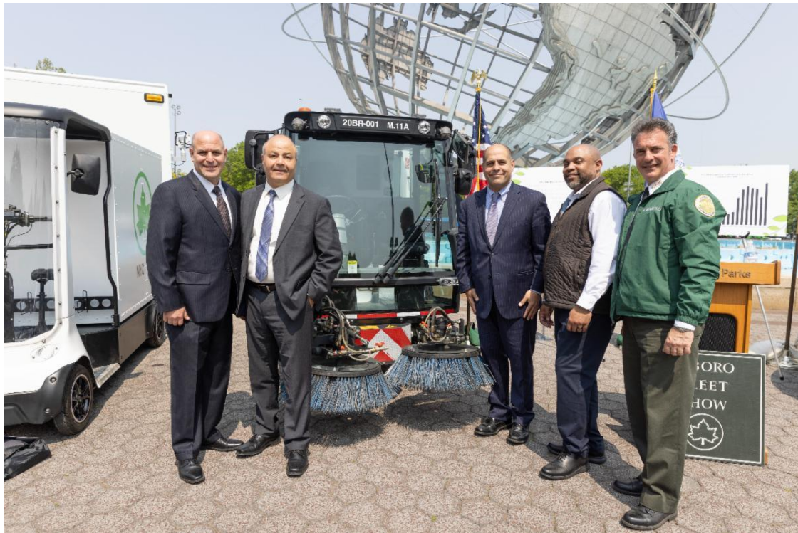
DCAS and DSNY teams with the DSNY new electric sweeper.

the national average of 36 MPG and shows that achieving major increases in fuel efficiency, as recently announced by the Biden administration, is achievable today.