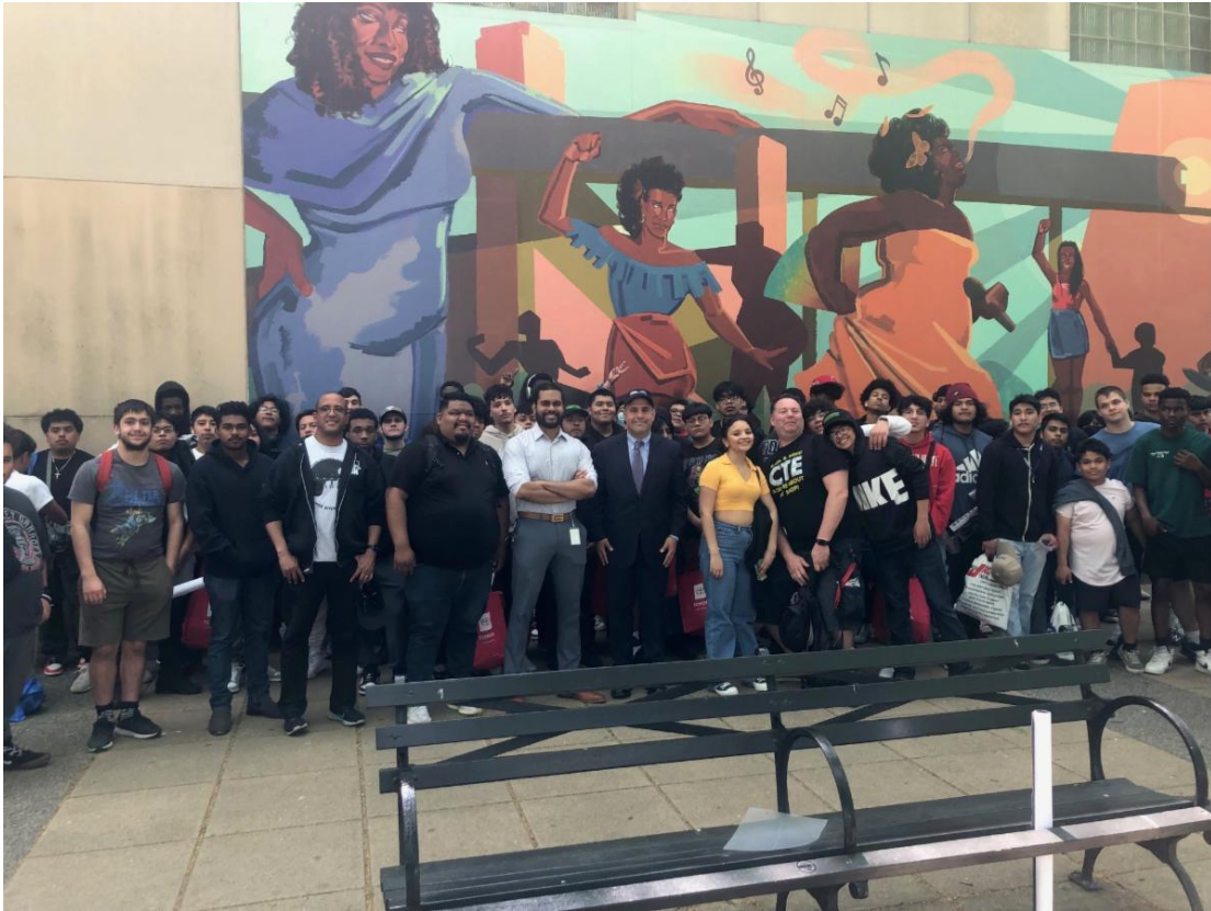
Department of Education and DCAS officials with over 125 students from the City's automotive high schools who participated in the show.