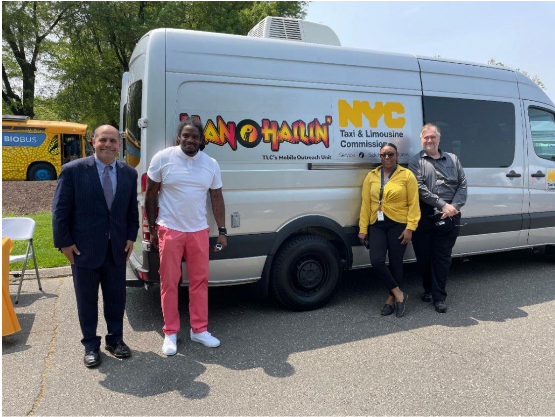
DCAS and TLC teams with the new TLC Van Hailin outreach van.

The NYC Fleet Show capped off a series of events in the City, nation, and internationally promoting sustainable fleet. DCAS and City fleet agencies participated in the Impulsion Quebec event March 13 to 15; the NY Auto Show April 7 through 16; Fleet International, the Show, on April 27 in London; and the Advanced Clean Transportation (ACT) conference May 1 through 4 in Anaheim, California where the City of New York was recognized with the public fleet sustainability national award. DCAS will post more about each event on our fleet website.