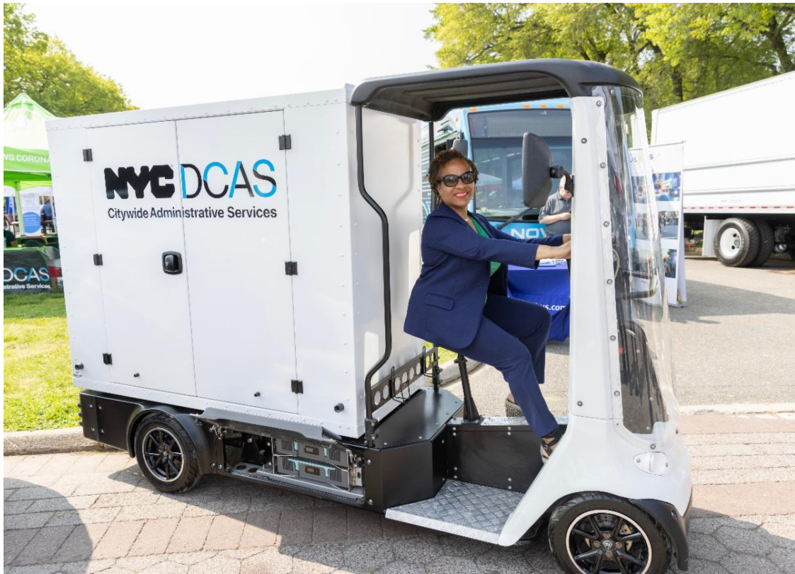
DCAS Commissioner Pinnock in the new DCAS electric cargo bike.

Fleet is an international industry and changes to fleet design for sustainability and safety require advocacy and focus across the public, private and non-profit sectors. There has never before been as much investment, energy and interest in cleaning and greening fleet vehicles.