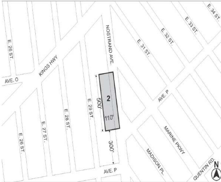
Mandatory Inclusionary Housing Area see Section 23-154(d)(3) Area # — [date of adoption] — MIH Program Option 1 and Option 2 Deep Affordability Option

Portion of Community District 15, Brooklyn