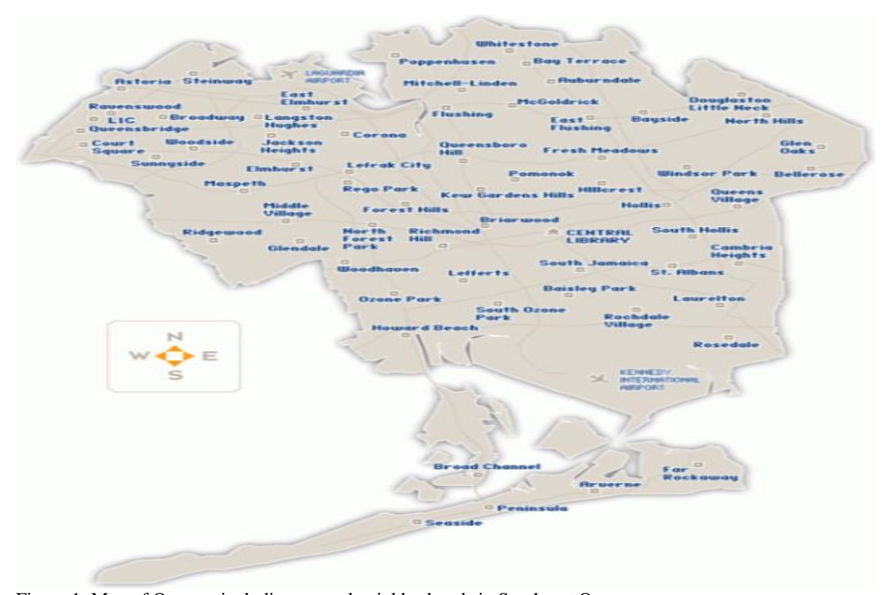
Figure 1: Map of Queens, including several neighborhoods in Southeast Queens.12

Conservation (DEC) temporarily pumped groundwater from Station 24 in Jamaica, which provided some relief to flooding in the area, but this pumping ceased and flooding problems continued. 10:11