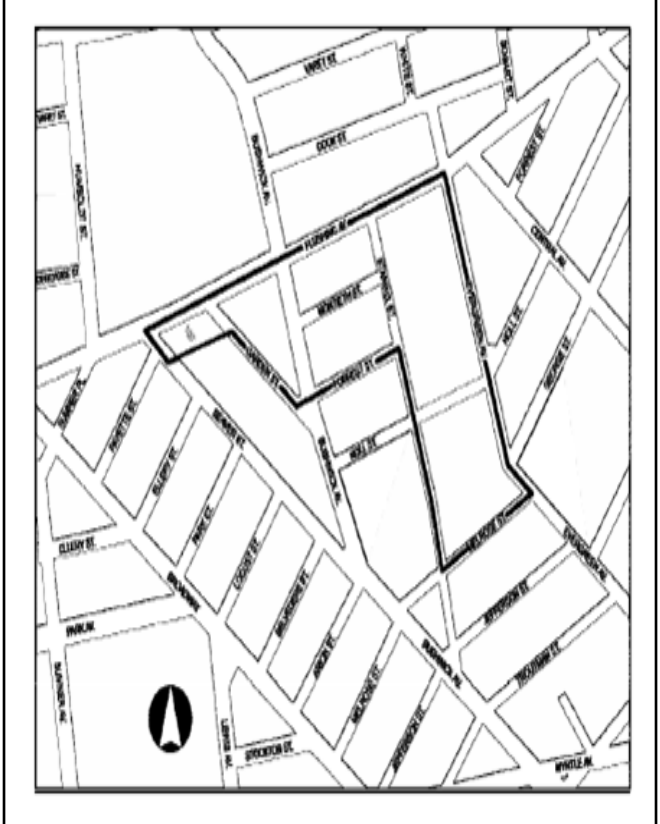
Portion of Community District 4, Brooklyn