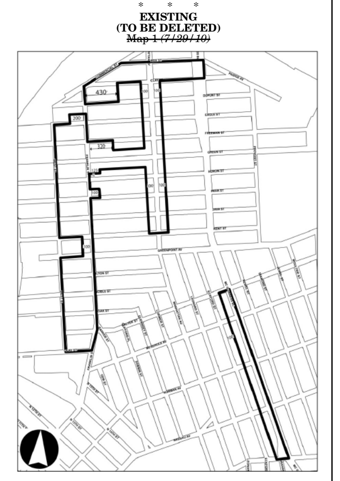
Portion of Community District 1, Brooklyn

In Waterfront Access Plan BK-1 and in the R6, R6A, R6B, R7A, R7-3 and R8 Districts within the areas shown on the following Maps 1, 2, 3 and 4: