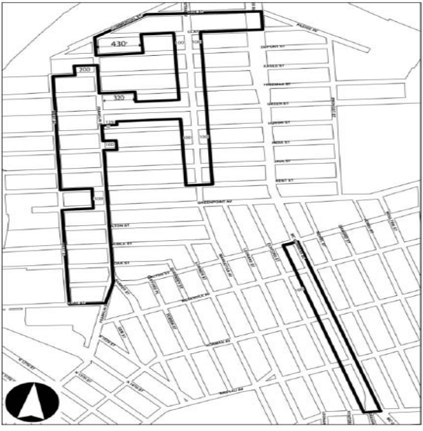
PROPOSED (TO REPLACE EXISTING)