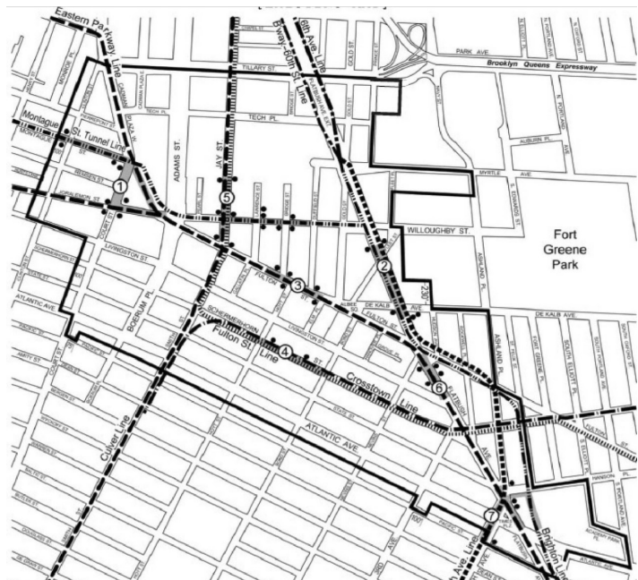
Map 7. Subway Station Improvement Areas [EXISTING MAP]

Flatbush Avenue Extension Height Limitation Area: Height Restriction of 400 Feet