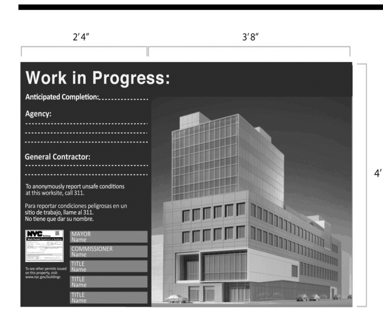
Figure Fence Project Information Panel Layout