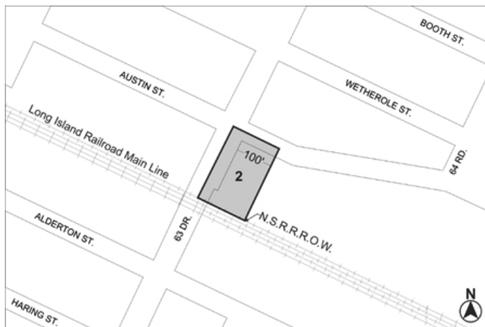
Map 2— [date of adoption]

■ Mandatory Inclusionary Housing Area (see Section 23-154(d)(3))