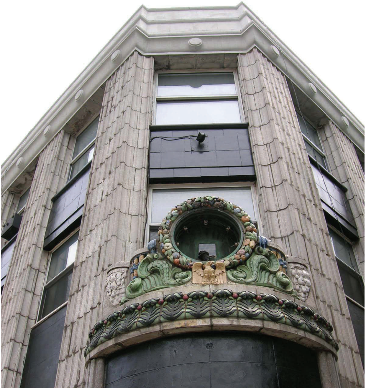
Public National Bank of New York Building, 106 Avenue C