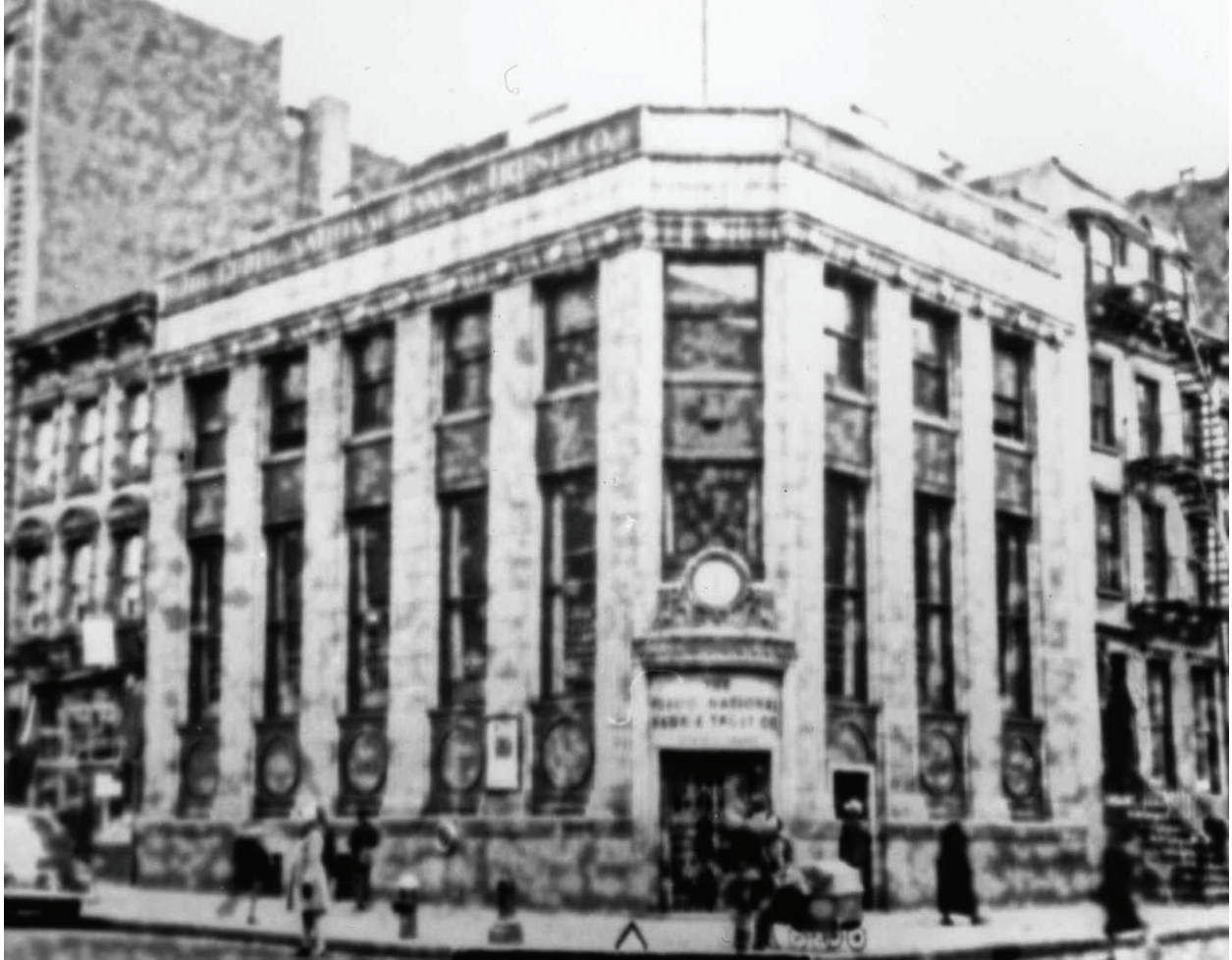
Public National Bank of New York Building, 106 Avenue C