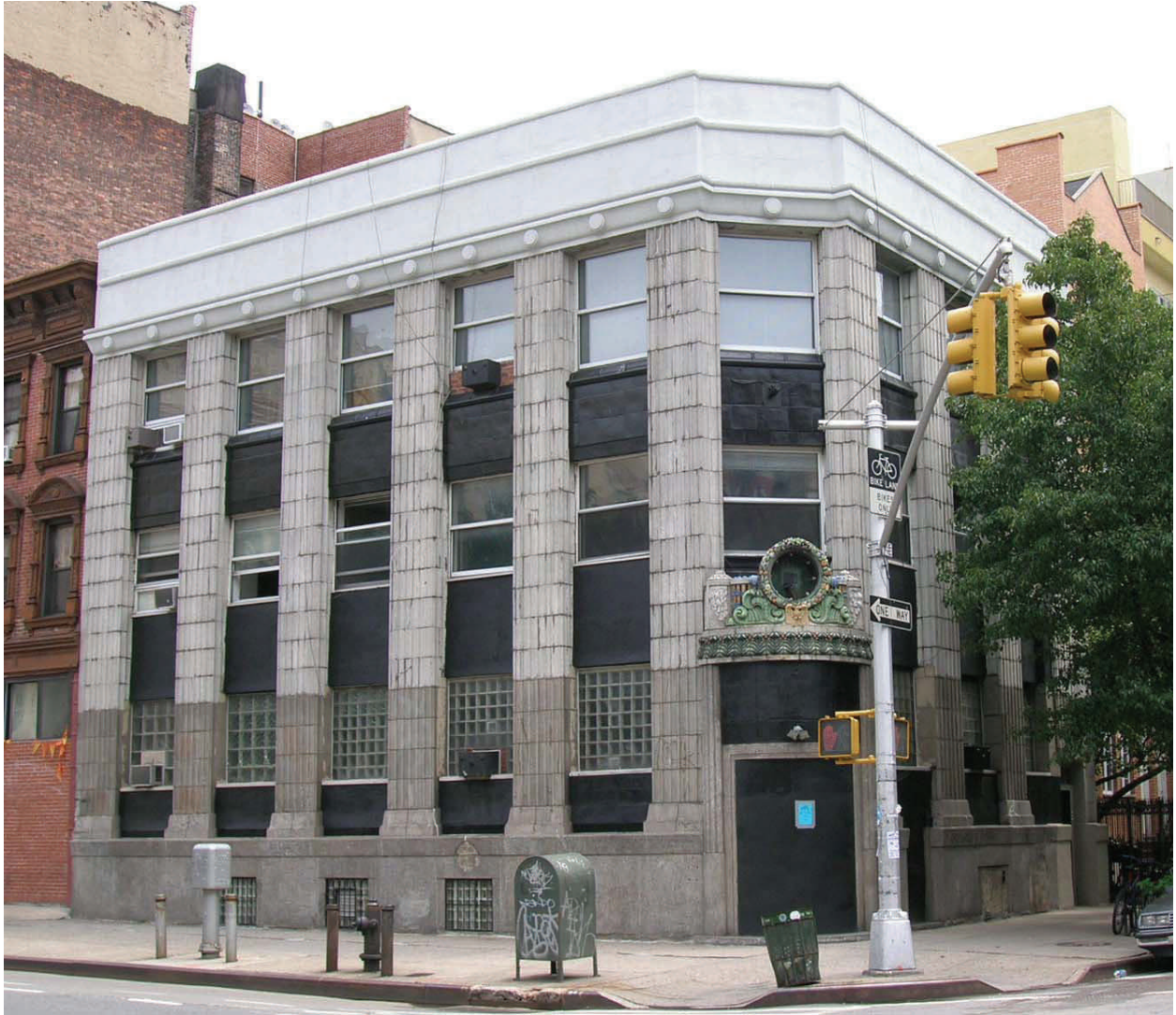
Public National Bank of New York Building, 106 Avenue C