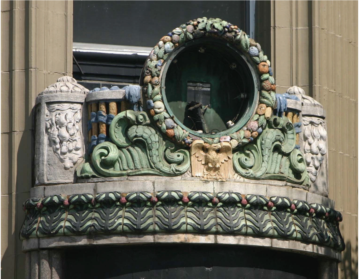
Public National Bank of New York Building, 106 Avenue C