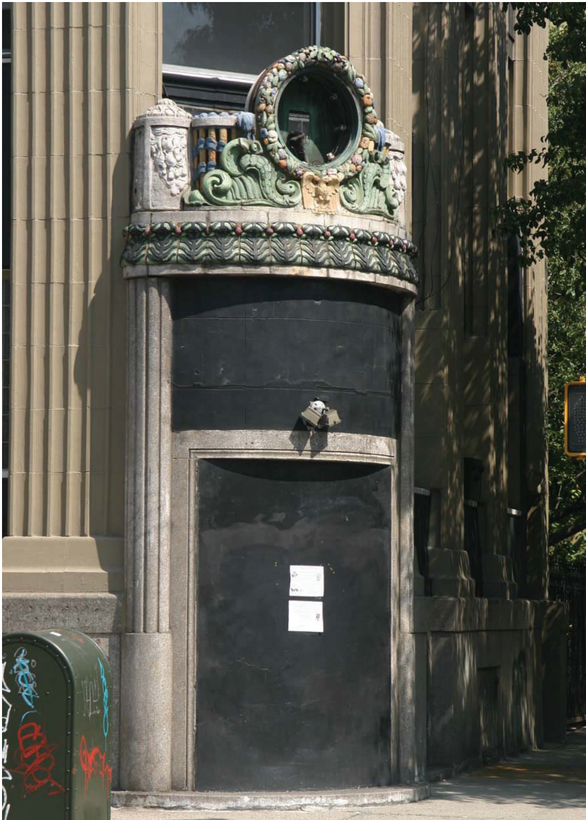
Public National Bank of New York Building, 106 Avenue C