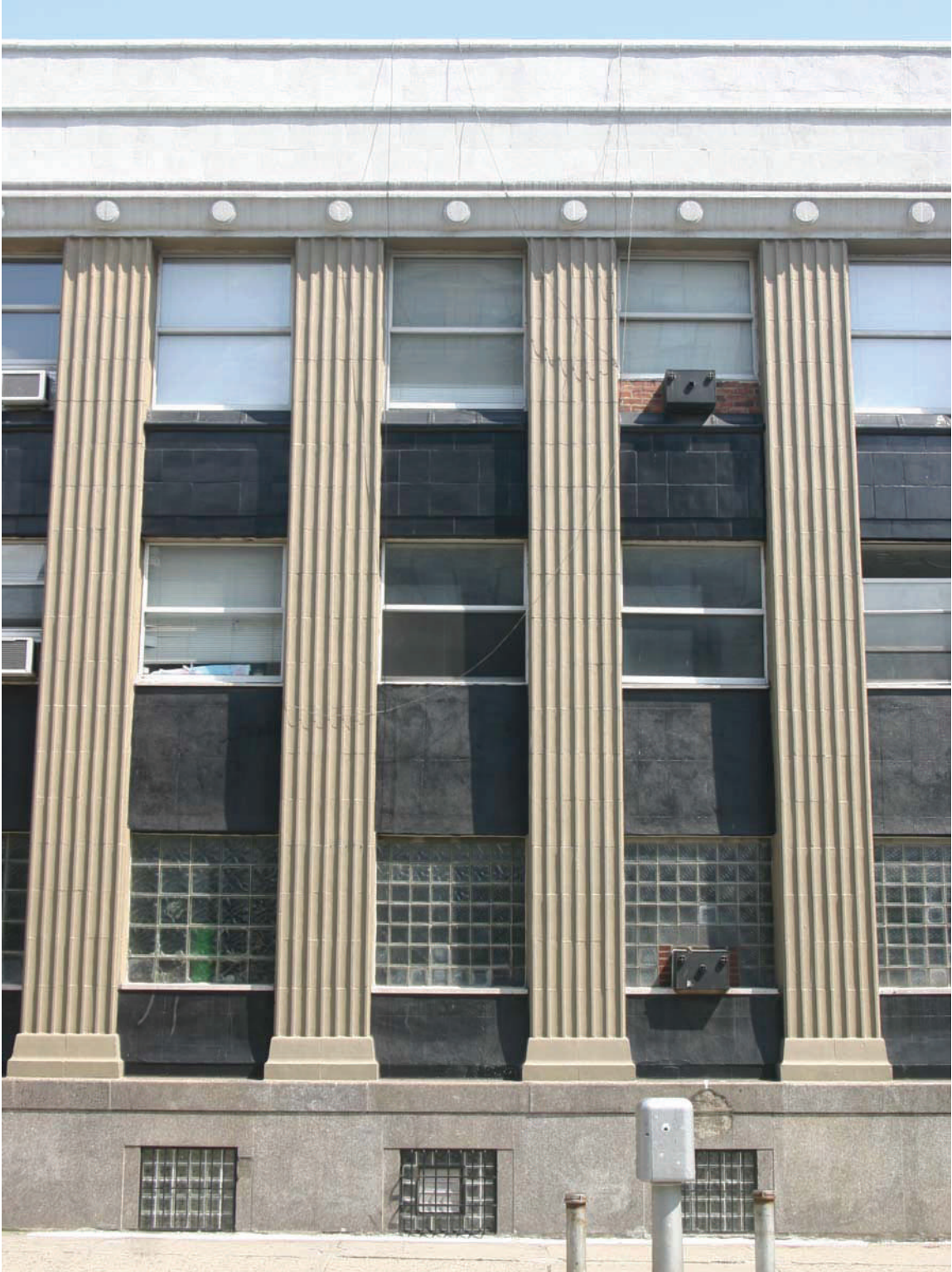
Public National Bank of New York Building, 106 Avenue C