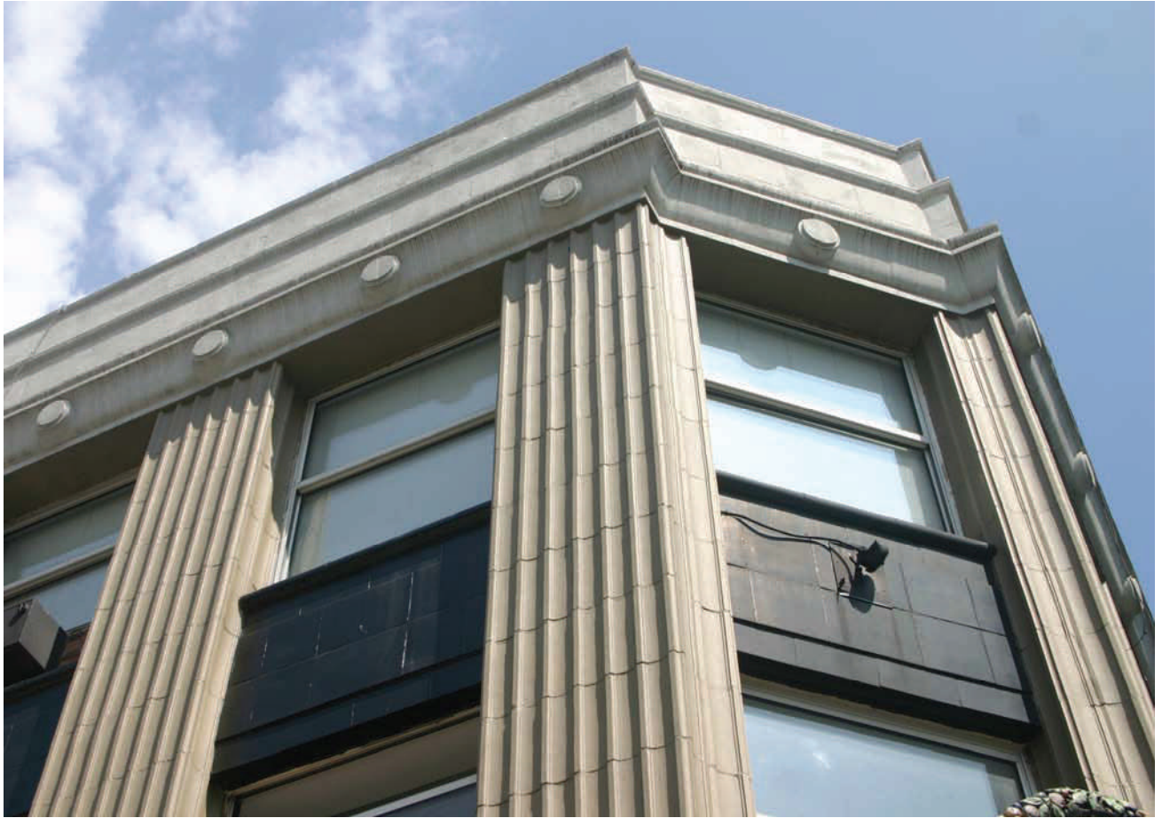
Public National Bank of New York Building, 106 Avenue C