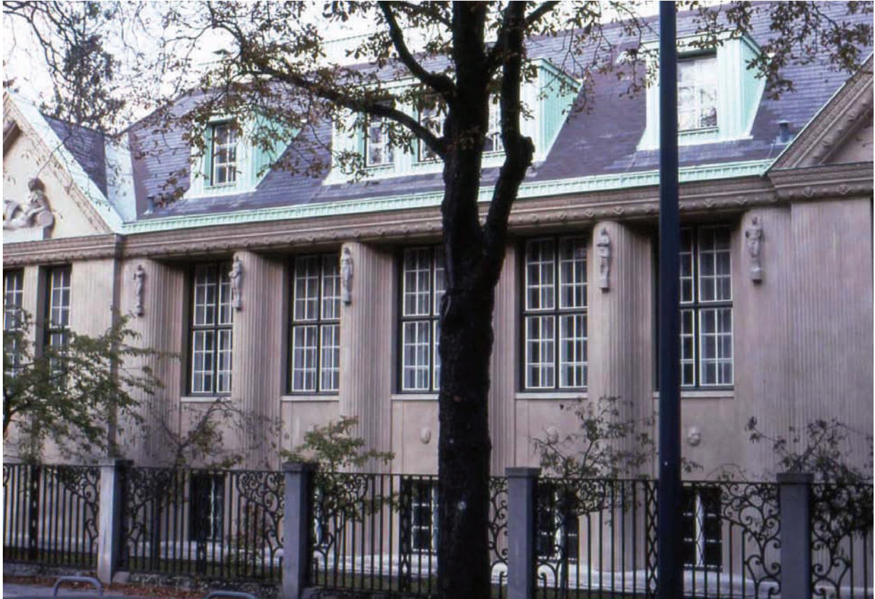
Villa Skywa (1913-15, Josef Hoffmann), Vienna