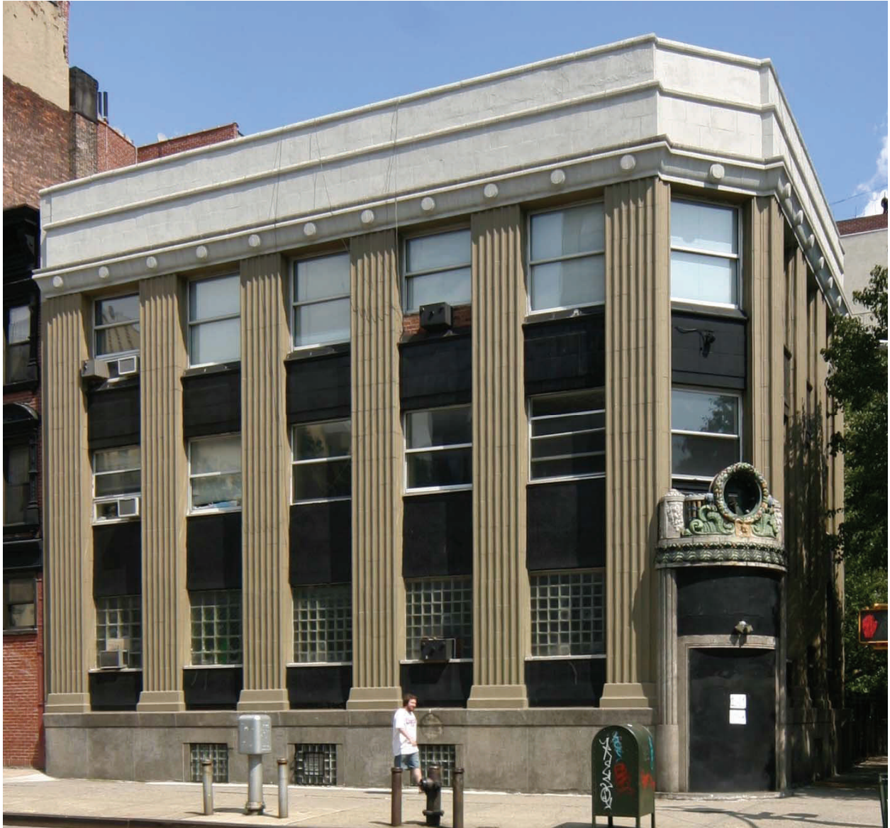
Public National Bank of New York Building, 106 Avenue C