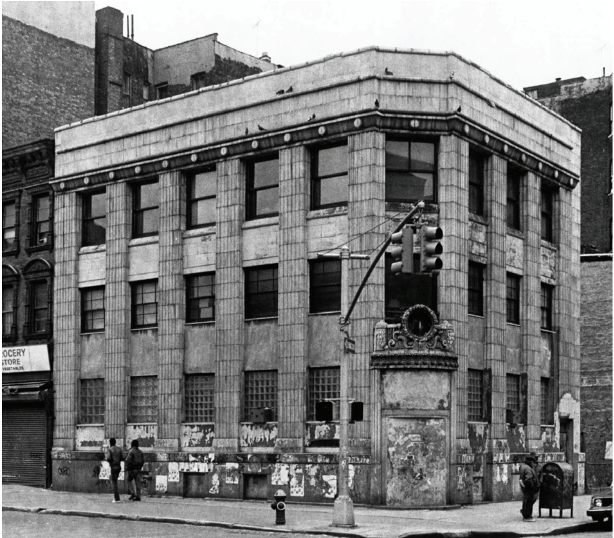
Public National Bank of New York Building, 106 Avenue C