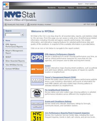
Screenshot of NYCStat Home Page

Other crucial steps in the development of the data presentation included decision-making about whether to measure year-to-date trends or measure against pre-set targets; designating the desired direction of each measurement (i.e. up, down or neutral); and developing thresholds (+/-10%) for good and poor performance. Finally, decision-making about how to best present the trend analysis—whether to use colors, data tables, or up/down arrows—was needed. Ultimately, we selected color-coded pie charts—with red, yellow and green to represent declining and good/stable performance—as the most user-friendly presentation on a dashboard.