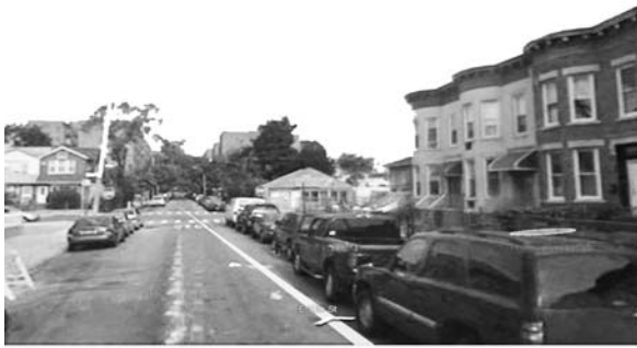
EXISTING SITE AND CONTEXT