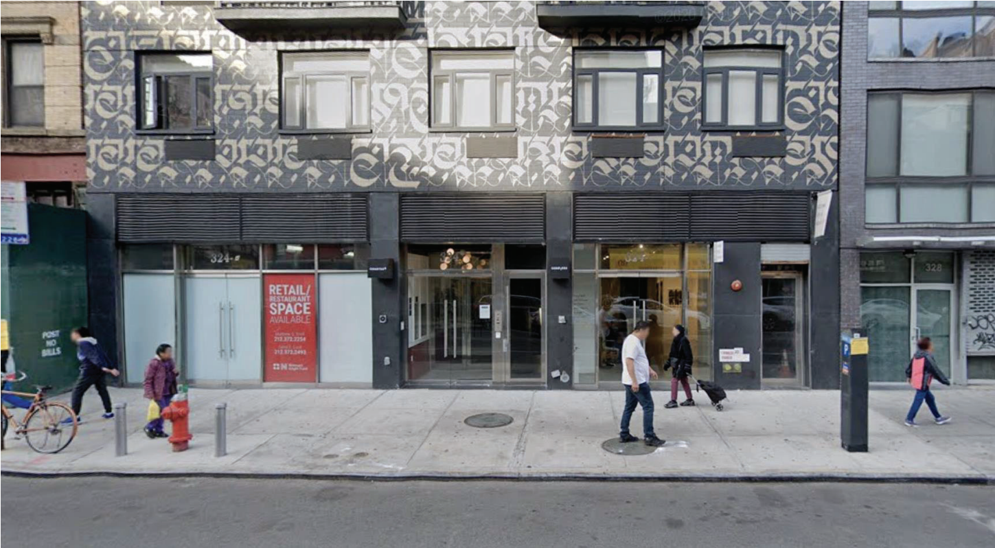
324 Grand St - Outside Photo