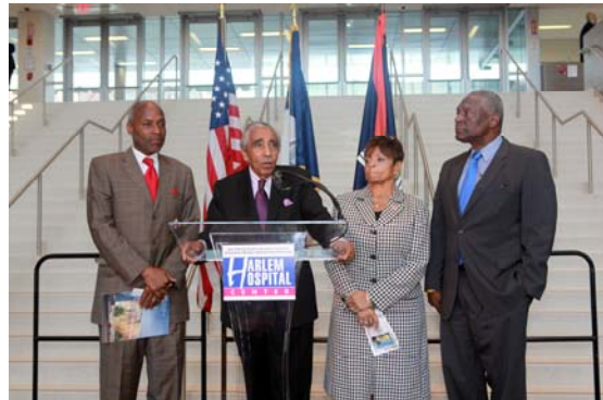
Senator Bill Perkins, Congressman Charles Rangel, Council Woman Inez Dickens and Assemblyman Keith Wright