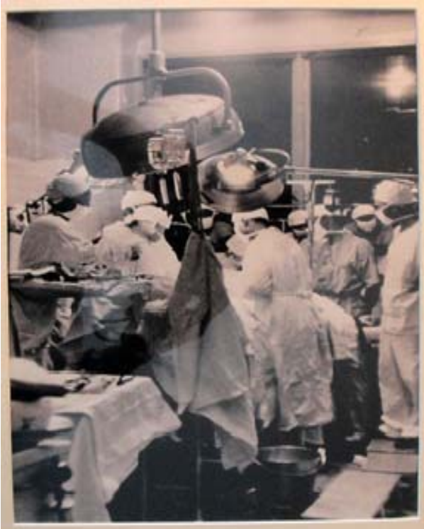
Harlem Hospital Center Surgeons operating on the Reverend Dr. Martin Luther King.