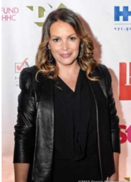
Radio/TV personality Angie Martinez