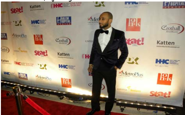
Swiss Beatz arrives at the event.