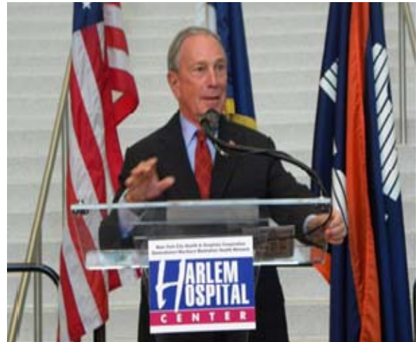
The Honorable Mayor Michael R. Bloomberg