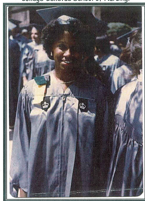
A Masters of Art degree in Health Education from Teachers College, Columbia University