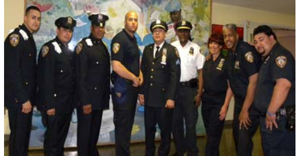
Harlem Hospital Police

Congressman Charles Rangel casually addressed the attendees of the Harlem Hospital Community Advisory Board's Annual Public Meeting that occurred on June 2, 2012.