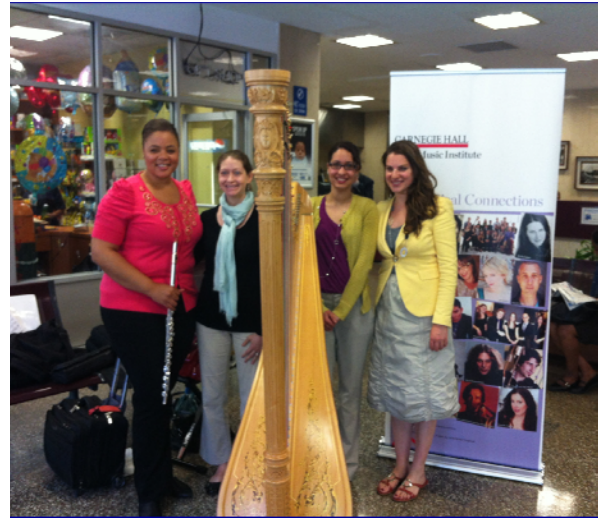
Carnegie Hall Musicians

If so, email your question, comment or concerns to yuvania.espino@nychhc.org . Your submission may be one of the ones chosen and featured in a future CHECK LIST .