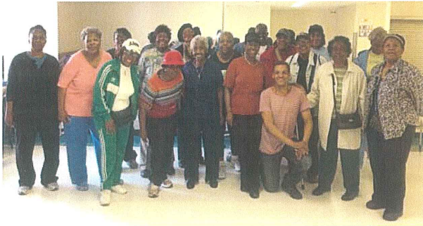
Members of the Dance of the Village Elders

The "Dance of the Village Elders" program, sponsored by The Friends of Harlem Hospital Center, Inc., is thriving! The program offers Jazz, West African, and Body Conditioning classes taught by dance instructors from the Alvin Ailey Dance Foundation to seniors age 50 and up. Over 75 community seniors and hospital patients have participated, and the number continues to grow!