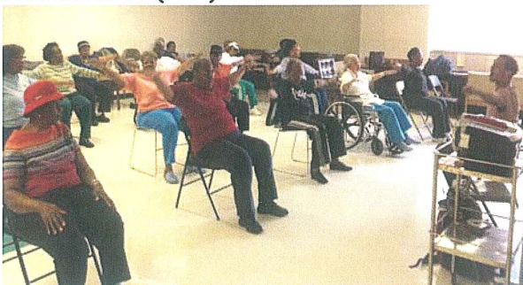
Dance class for Seniors