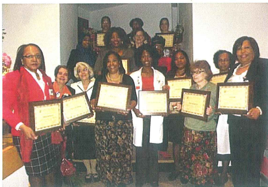
Honorees at the 2012 Network Women's History Month