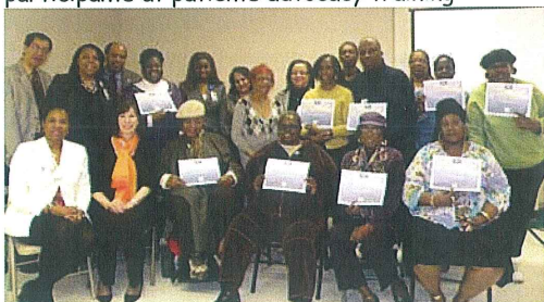
Participants received a certificate of completion