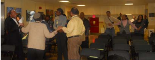
Audience forms mini circles and sing "We Shall Overcome"