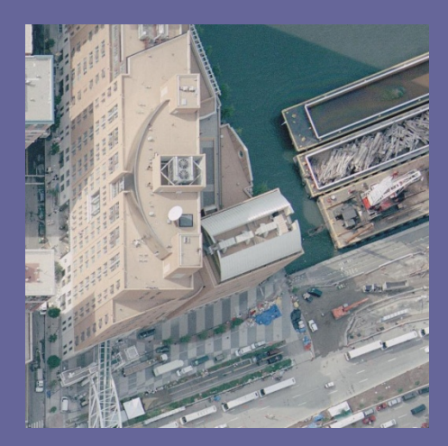
Stuyvesant High School (left) & Debris Barge (right)

Below: debris truck passes between BMCC & Stuyvesant, with dust flying off the truck bed.