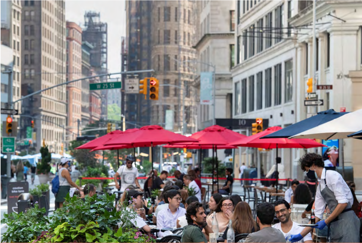
2 Outdoor Dining