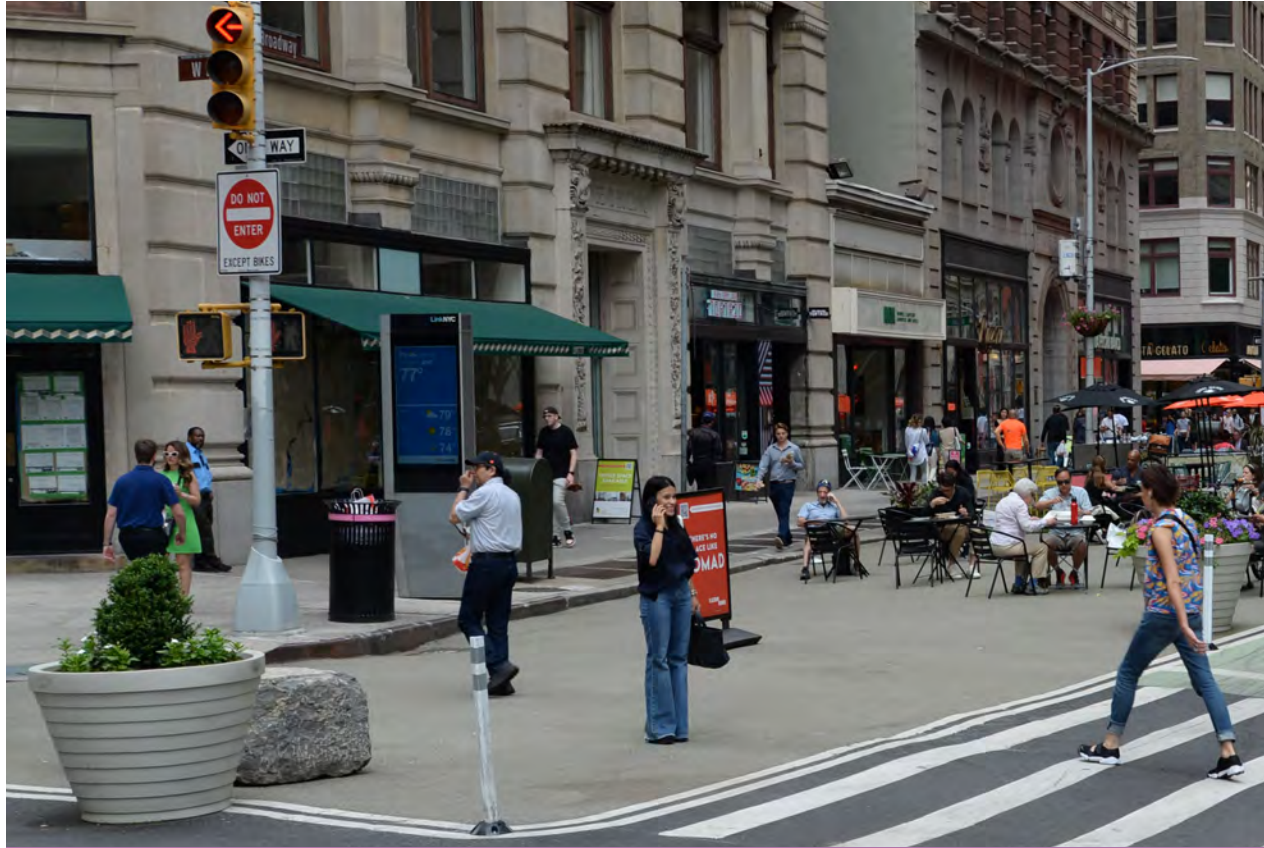
4 Public Space & Public Amenities