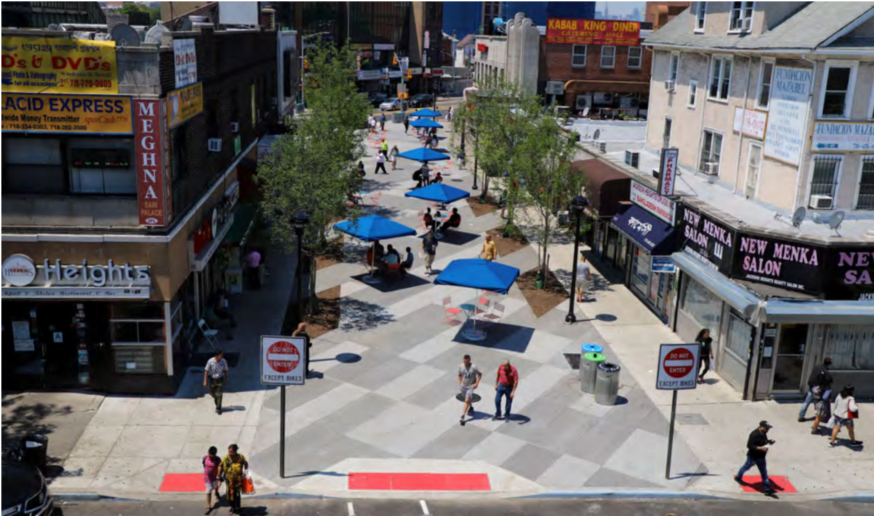
New Public Spaces & Open Streets

Where in the neighborhood would you like to see the toolkit items shown below?