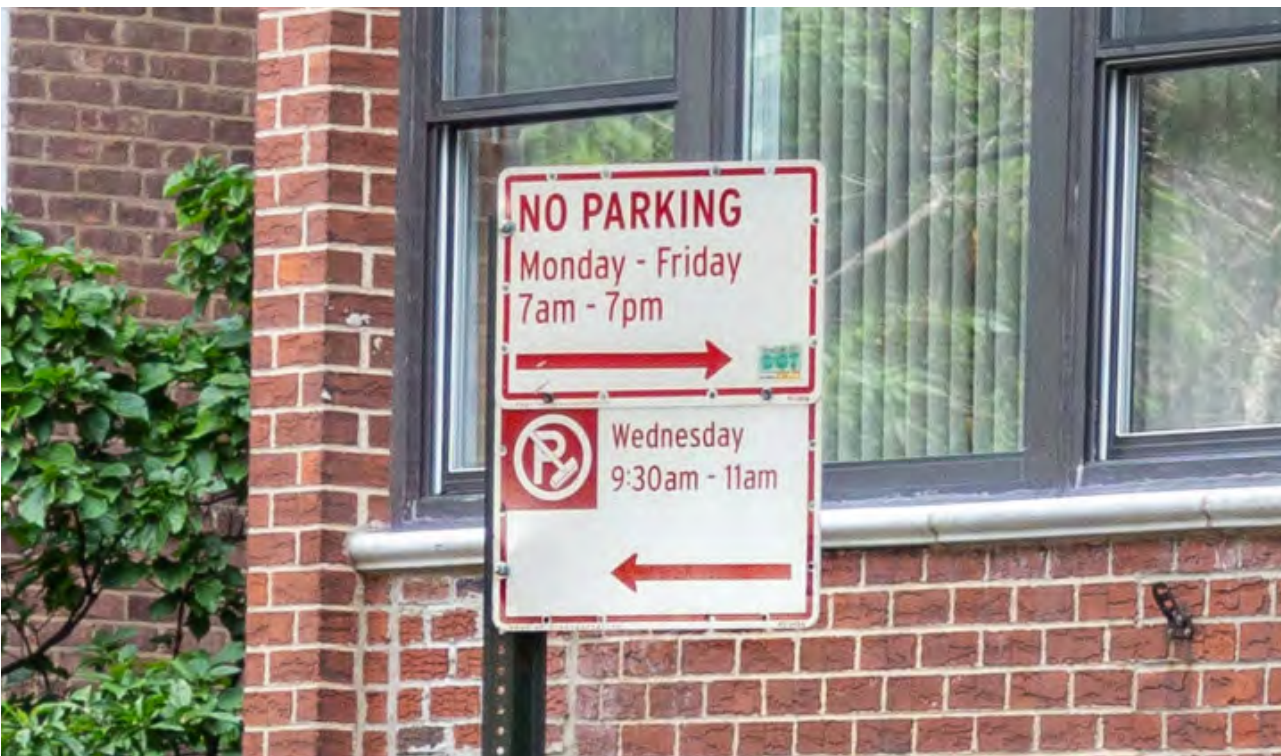
Delivery & Curb Use Management