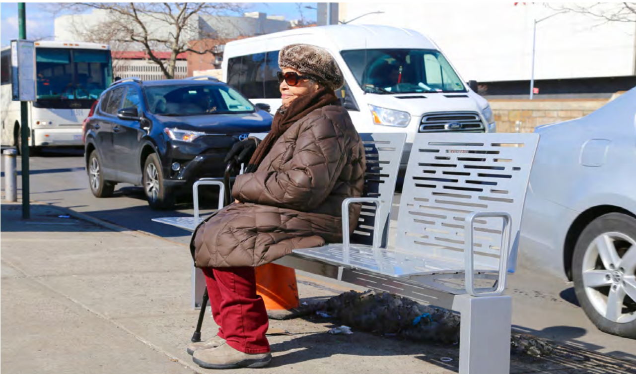
Public Amenities & Street Furniture