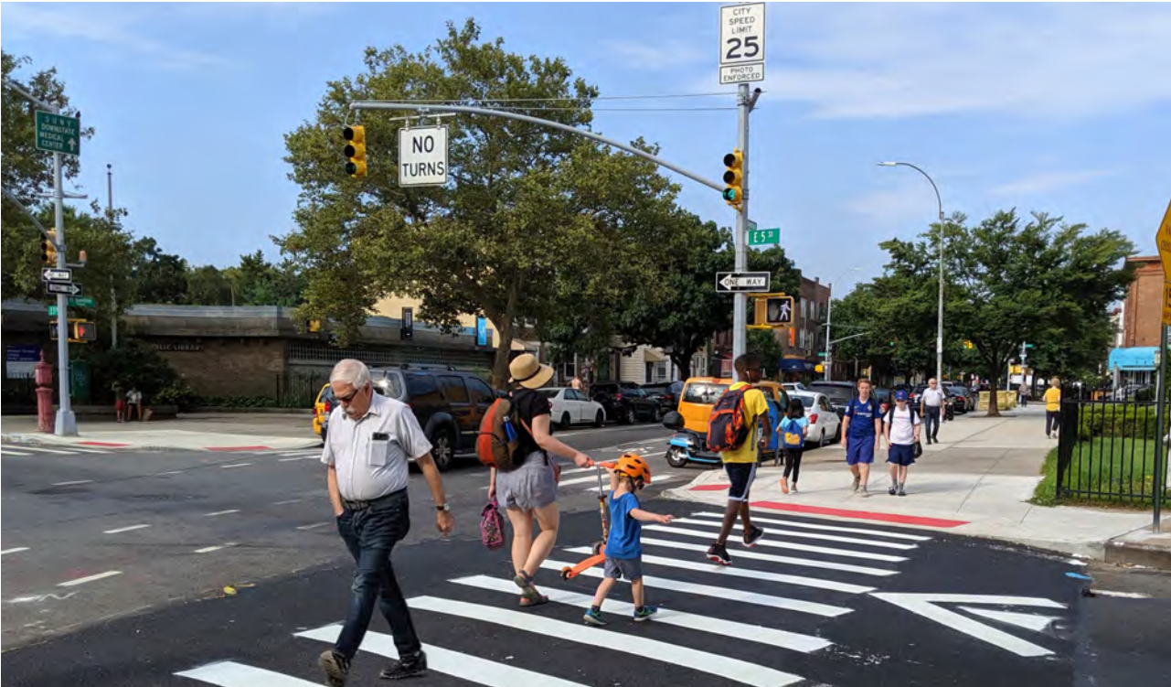
Intersection Improvements & New Crossings