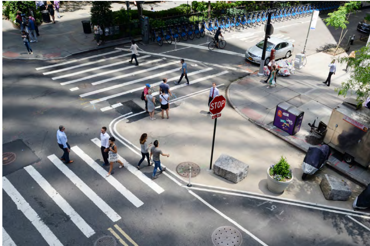
5 Pedestrian & Safety Improvements

Support Current Uses & Open Street Operations