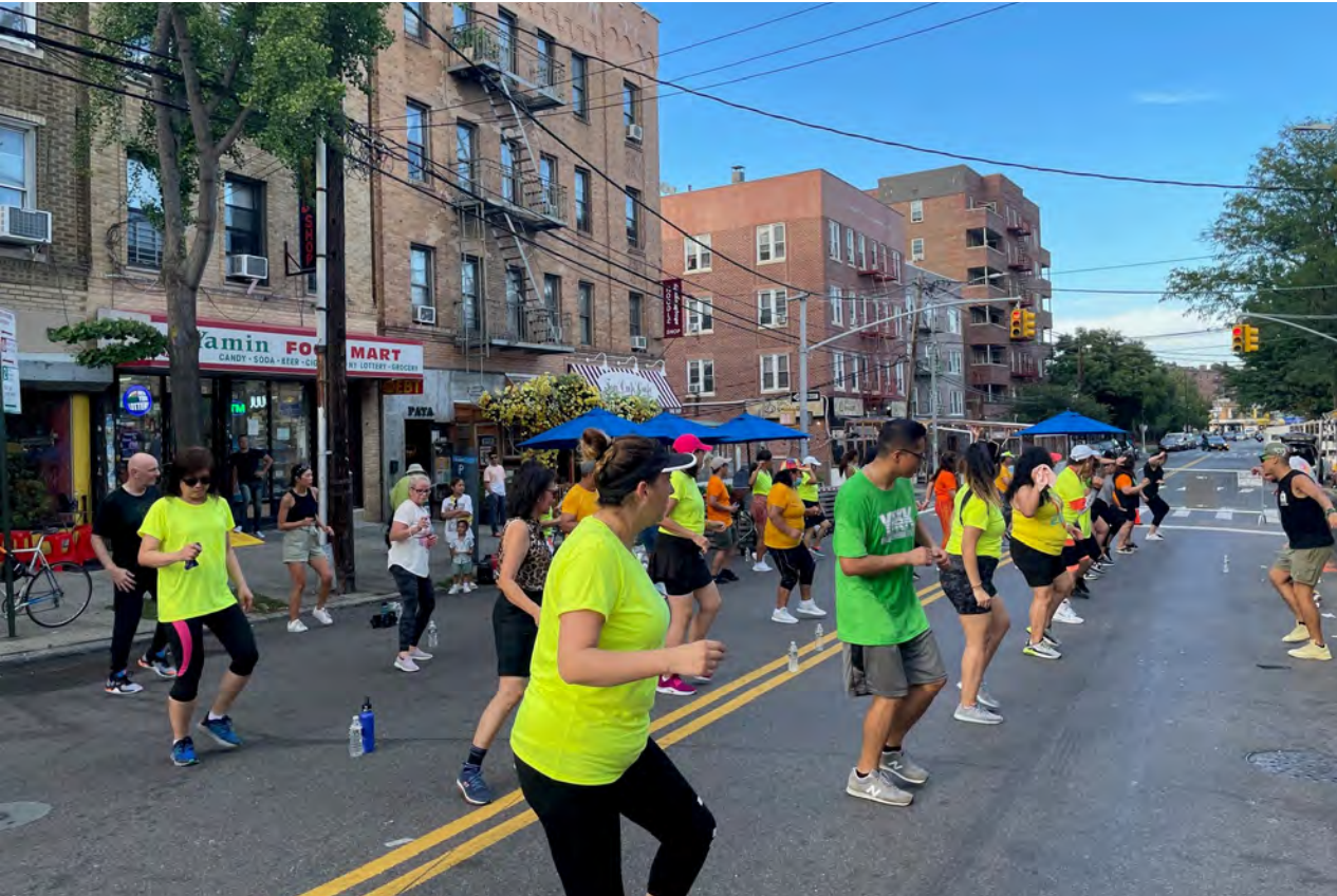
1 Time of Day Closure & Programming