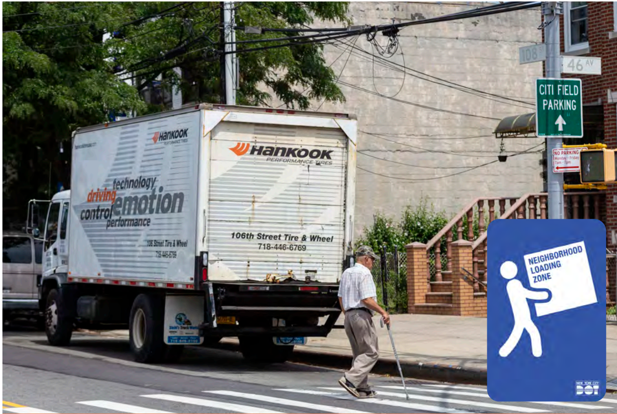
3 Delivery Management & Loading Zones