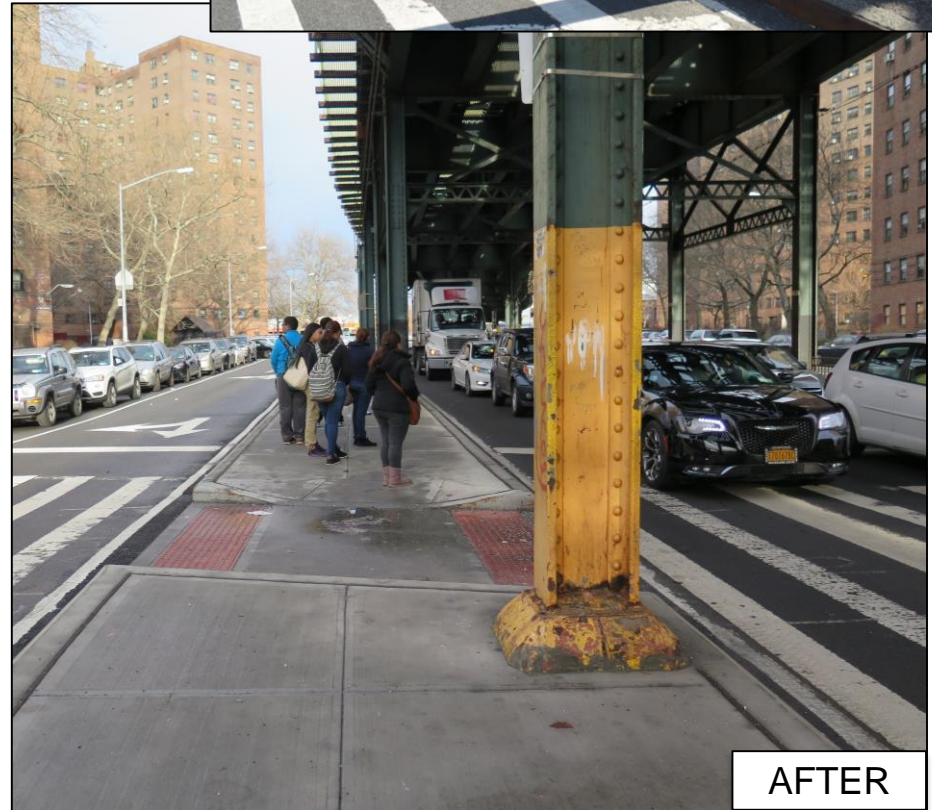
Broadway and W 228 th St