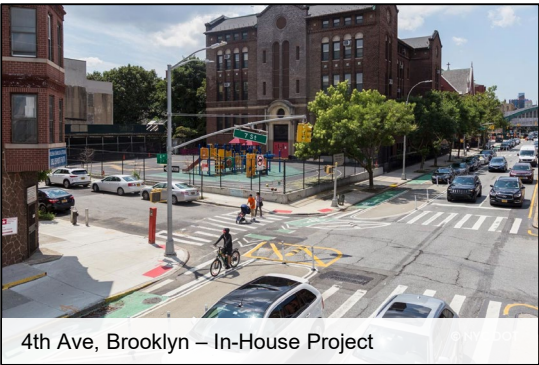
4th Ave, Brooklyn – In-House Project