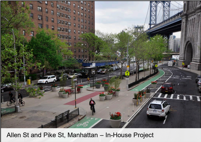
Allen St and Pike St, Manhattan – In-House Project