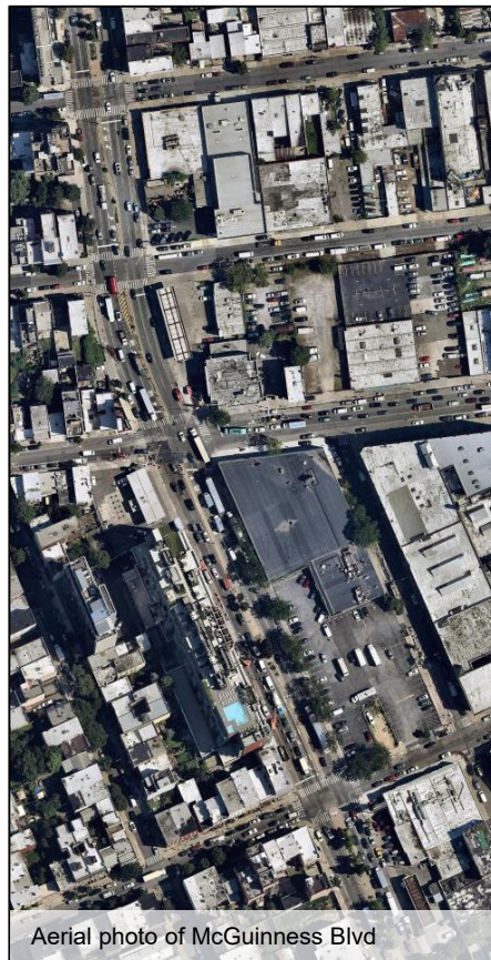
Aerial photo of McGuinness Blvd