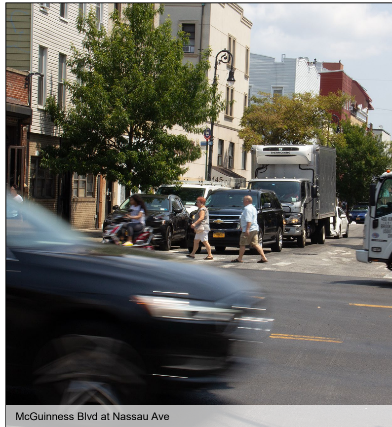
McGuinness Blvd at Nassau Ave

What is your relation to McGuinness Blvd?