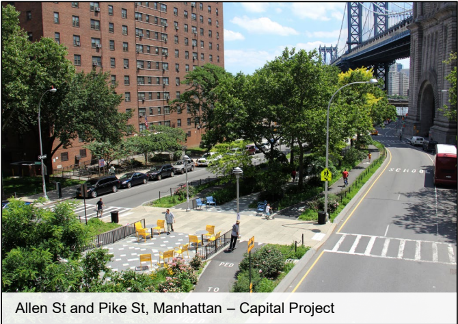
Allen St and Pike St, Manhattan – Capital Project