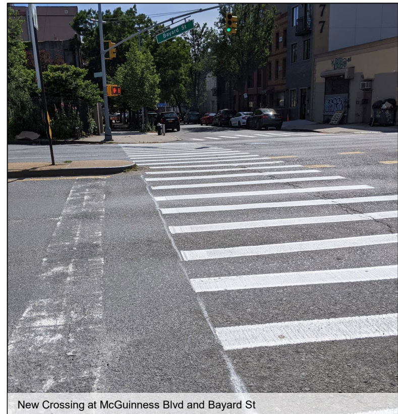
New Crossing at McGuinness Blvd and Bayard St