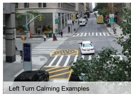
Left Turn Calming Examples