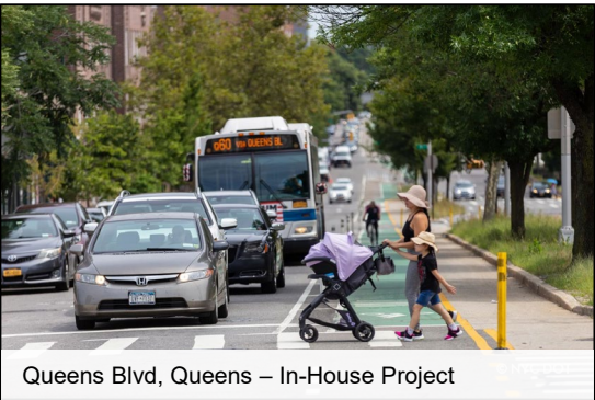
Queens Blvd, Queens – In-House Project