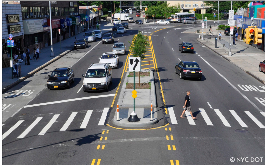
Similar Configuration: Hillside Ave and 172 St, Queens