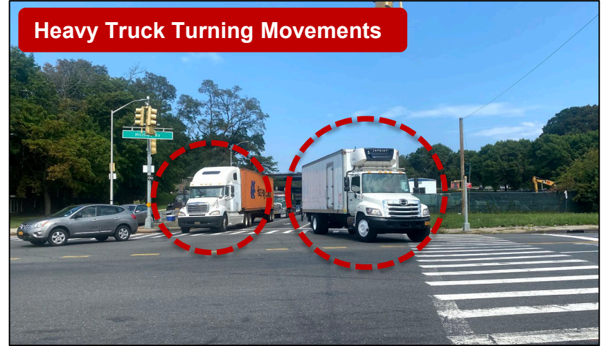
Heavy Truck Turning Movements