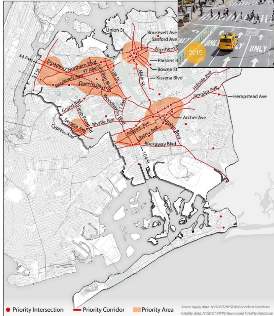
Queens Vision Zero Map