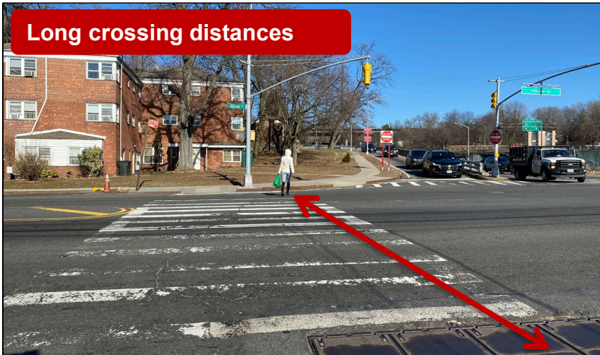
Long crossing distances