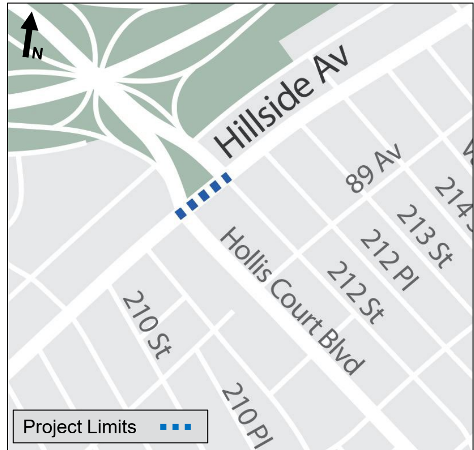
Hillside Ave, Hollis Court Blvd to 212 St