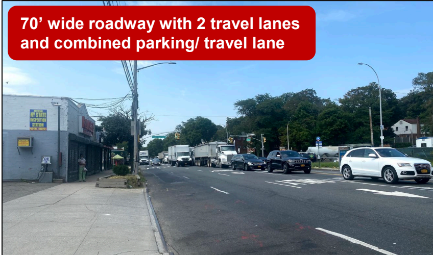
70' wide roadway with 2 travel lanes and combined parking/ travel lane