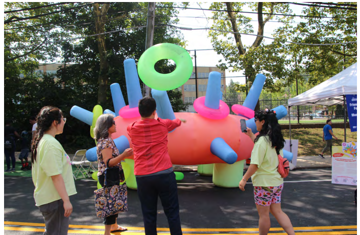
Mookntaka Friends & Follies, 2025