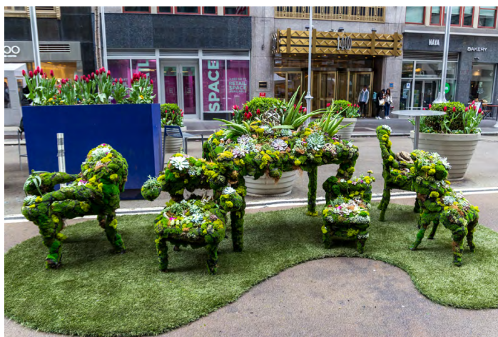
Natalie Collette Wood EcoHarmony, 2024