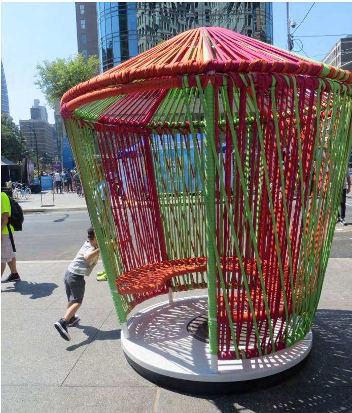
Héctor Esrawe Los Trompos (Spinning Tops), 2016