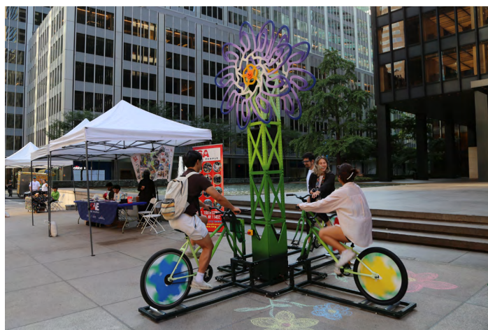
Acrylicize Collective Bloom, 2025