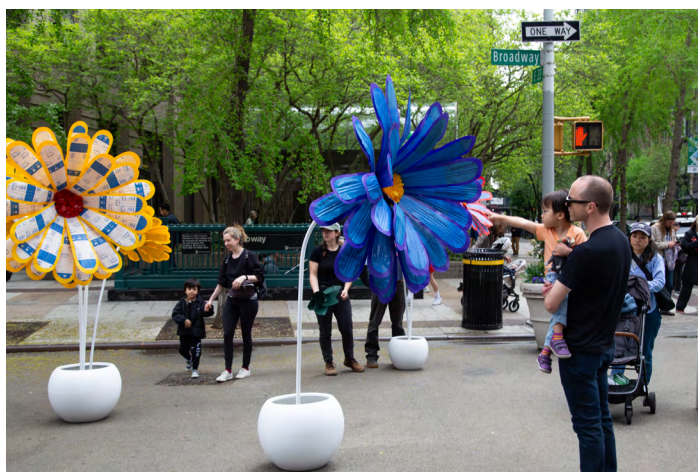
Molly Gambardella Asphalt Asters, 2025