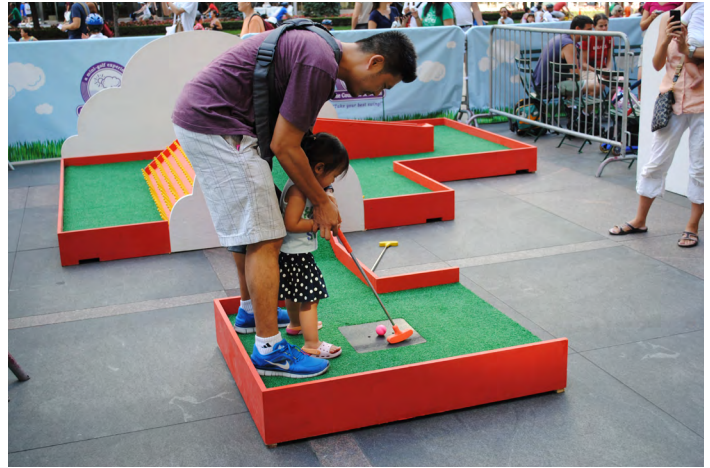
Risa Puno The Course of Emotions, 2013