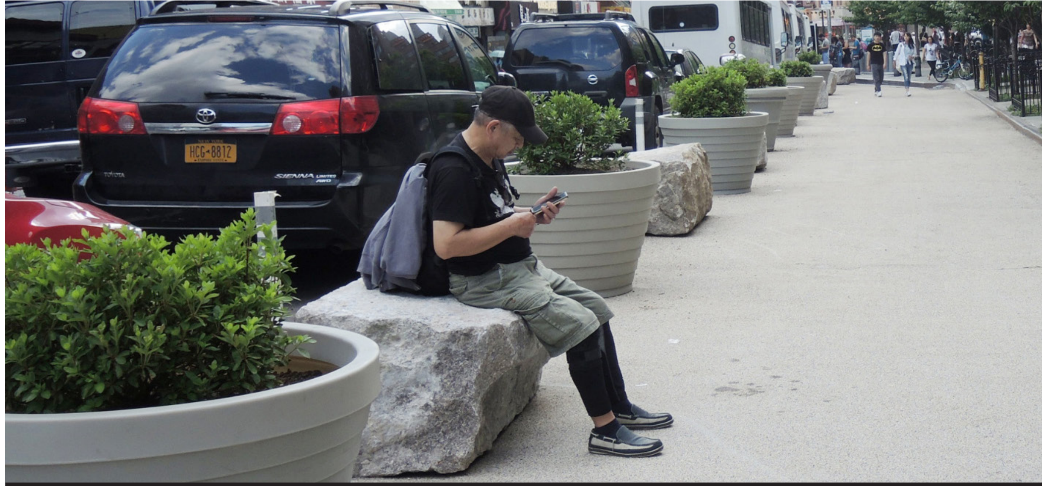
Planters, Blocks, and Other Edge Objects