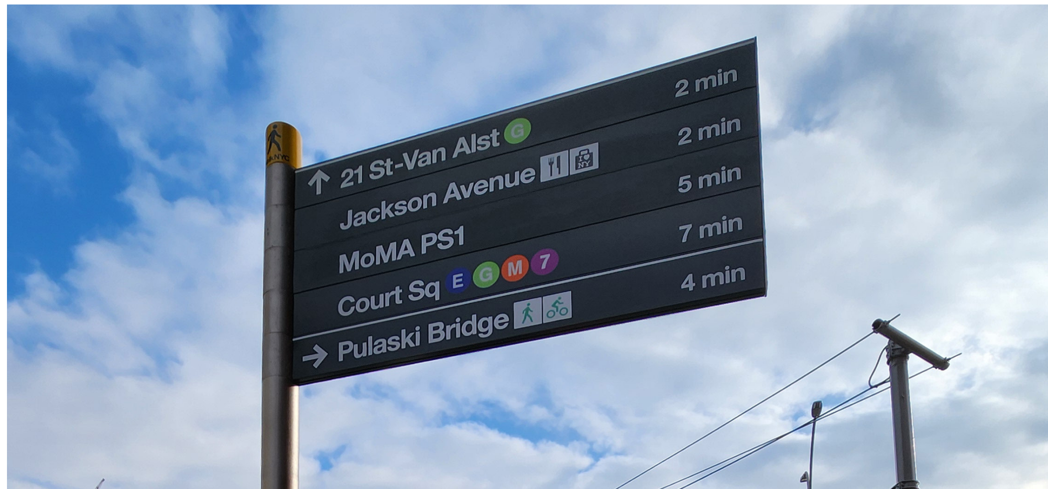
Wayfinding and Signage