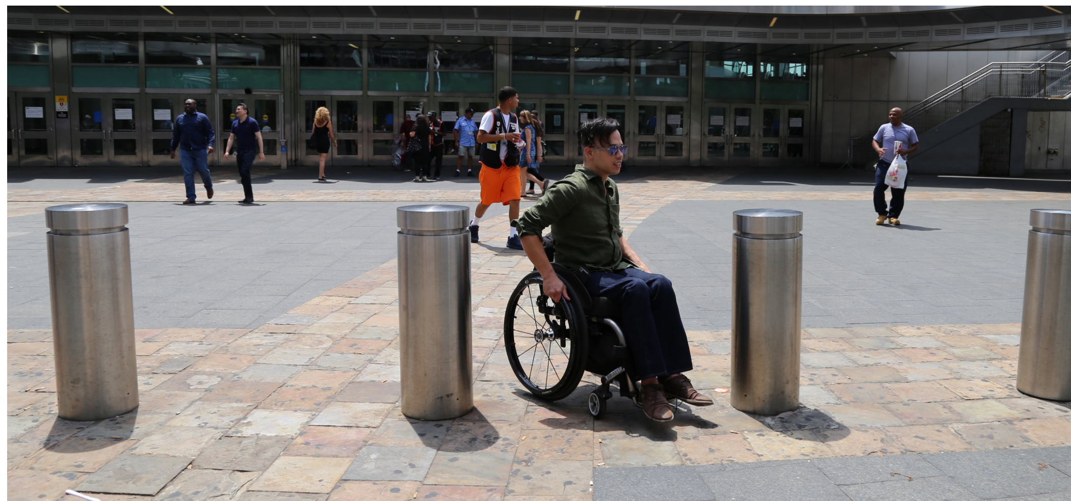
Security Infrastructure Reorganization