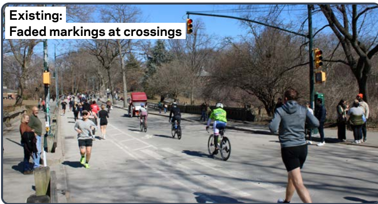
Existing: Faded markings at crossings