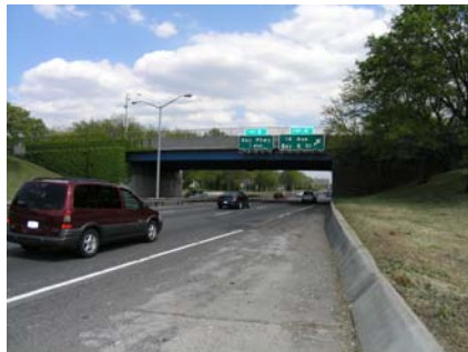
Bay 8 th Street Bridge.

Cleaning and painting of the bridge, which began in August 2006, was completed on September 28, 2006.