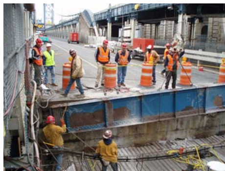
Removal of First Floorbeam for Lower Roadway Reconstruction.

Effective October 15, 2006, the lower roadway was closed to traffic for one year. The first floorbeam was removed on October 17, 2006 at the Manhattan approach.