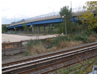
Page Avenue Bridge.

Cleaning and painting of the bridge, which began in April 2006, was completed on May 24, 2006.