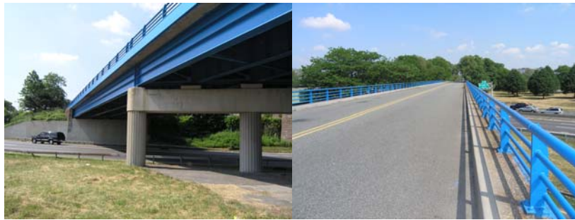
Aqueduct Racetrack Ramp.

Cleaning and painting of the bridge, which began in July 2006, was completed on October 30, 2006.