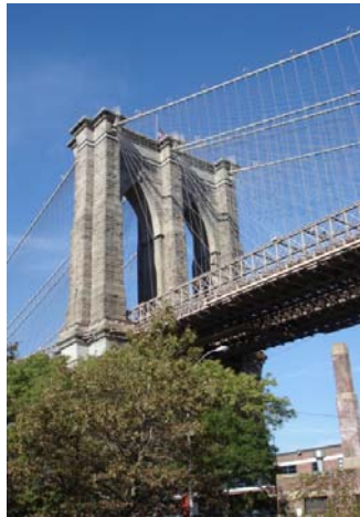
Brooklyn Bridge Flag at Half-Mast.