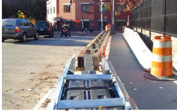
Completed West 239 th Street Bridge and Impact Attenuator.