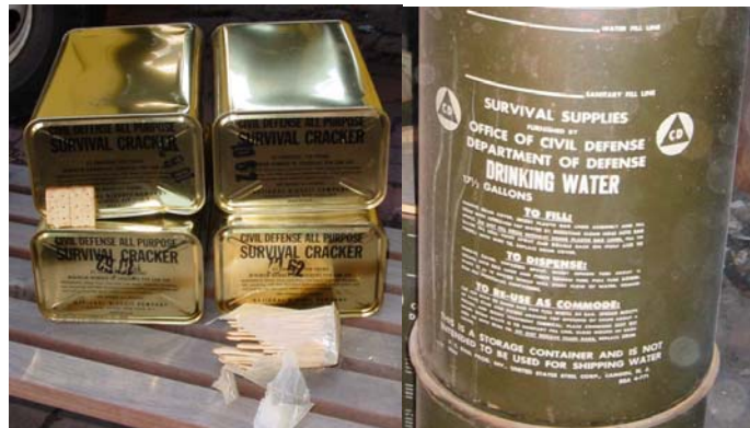
Crackers (An Estimated 140 Boxes, Each Containing Six Cans, For a Total of Some 352,000 Crackers) and Drinking Water.

Responding to DOT's announcement in March 2006 that a cache of Civil Defense emergency supplies were found inside the masonry foundations of the Brooklyn Bridge in Lower Manhattan, print, TV, and wire service reporters were allowed to photograph the items and interview the DOT personnel who came upon the items. The items, dated 1957 (year of the USSR launch of the Sputnik satellite) and 1962 (year of the Cuban missile crisis), included some 352,000 survival crackers, 50 containers to hold water and serve as commodes, medical kits, and waterproof paper blankets (labeled "for use only after enemy attack"). The items will be inventoried and sent to a civil defense museum.