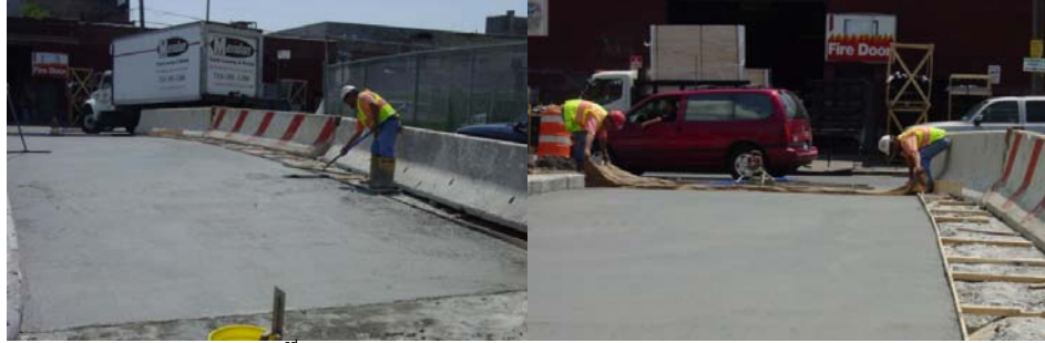
East 173 rd Street Repairs in Progress.