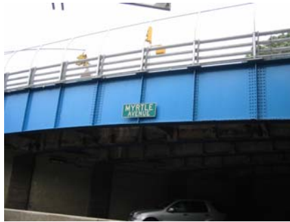
Myrtle Avenue Bridge.