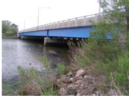
Richmond Avenue Bridge.