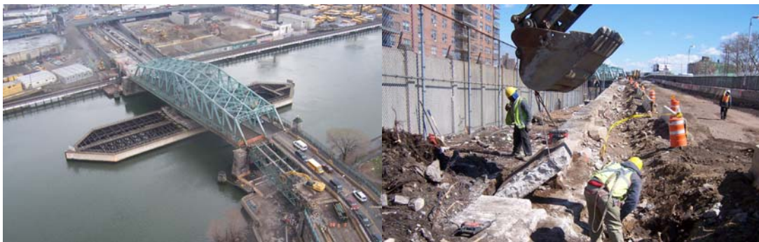
Aerial View of 145 th Street Bridge. Demolition of Manhattan Approach.

Stage I reconstruction of the bridge began on March 16, 2006. The Manhattan-bound roadway and sidewalk were closed and one lane of traffic in each direction, as well as pedestrian access, were maintained on the south half of the bridge.