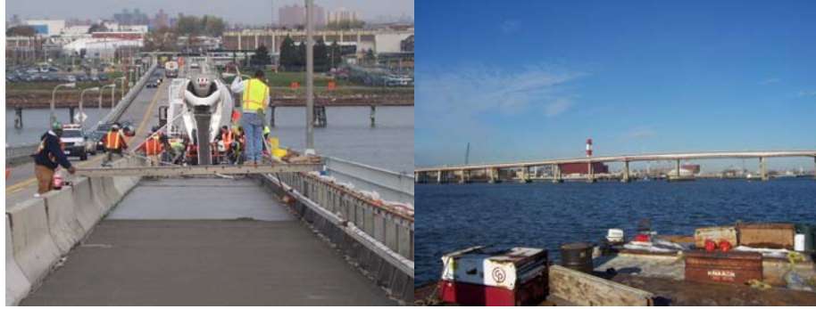
Concrete Placement. View of Rikers Island Bridge.