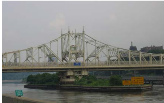
Macombs Dam Bridge.

May 1, 2006 marked the 111 th anniversary of the opening of the bridge.