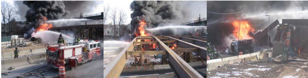
Putting Out the Fire on the Roosevelt Avenue Bridge.

On January 16, 2006, a tanker truck carrying 8,000 gallons of gasoline, traveling through the work zone of the NYSDOT contract for the replacement of the City-owned bridge overturned, hit the supports of an incomplete temporary bridge, and burst into flames, bringing down portions of the temporary bridge. After the fire was brought under control, engineers from NYSDOT and NYCDOT inspected the bridge. No significant fire damage was observed. By approximately 5:00 AM on January 17, 2006, the three westbound lanes and one eastbound lane were clear of debris and fire suppression material, and were reopened. The two remaining eastbound lanes were reopened at approximately 4:30 PM that afternoon.