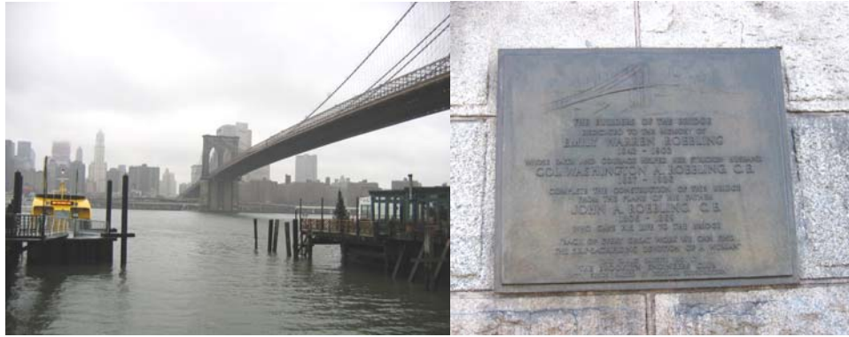
Water Taxi Dock Near the Brooklyn Bridge. Roebling Memorial Plaque.