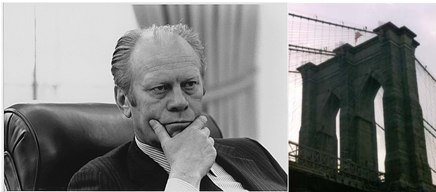
President Gerald Ford.

The American flags on the Brooklyn Bridge were lowered to half-mast on December 27, 2006 in tribute to former President Gerald R. Ford, who died at age 93 on December 26, 2006. Mr. Ford served as the 68 th president of the United States from 1974 to 1977. In 1999, President Bill Clinton conferred on President Ford the Medal of Freedom, the nation's highest civilian honor. He also received the Congressional Medal of Honor. The flags remained at half-mast until January 27, 2007.