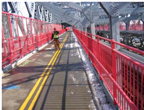
Inspecting the Williamsburg Bridge South Footwalk After Snow Removal.

From January 14 through January 16, 2006, Division personnel applied anti-icing chemicals 12 times to the East River bridges. Icicle patrols monitored the FDR Drive, the Battery Park Underpass, the Brooklyn-Queens Expressway, and the Cross Bronx Expressway.