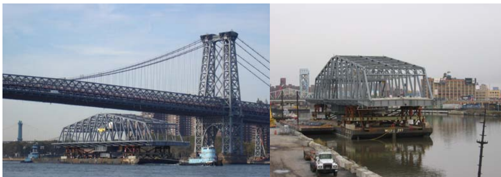
Passing Under the Williamsburg Bridge. Third Avenue Bridge Site. (Site Credit: Russell Holcomb)