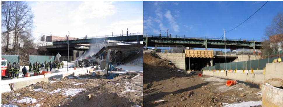
Inspecting the Damage.