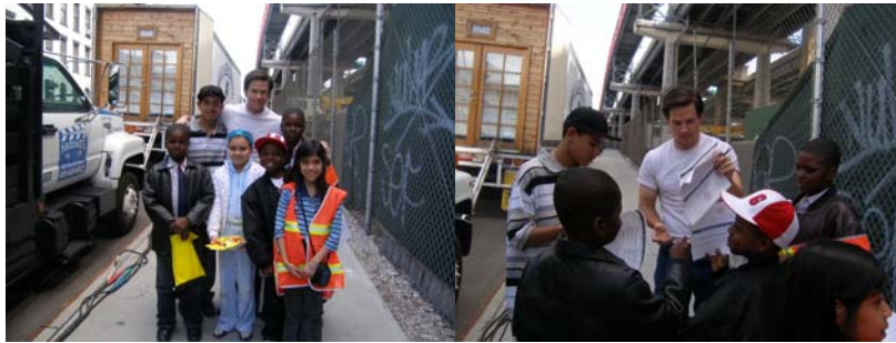
Actor Mark Wahlberg Posing With the Children During a Break From Filming "We Own The Night."