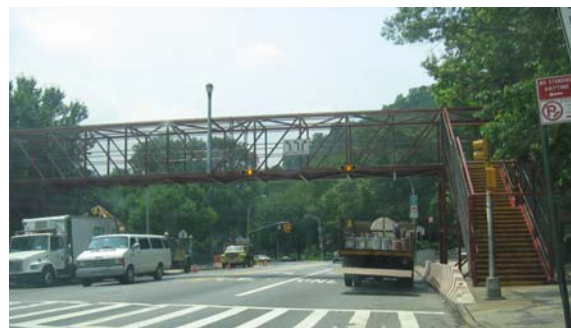
PS-5 Pedestrian Bridge.

Cleaning and painting of the bridge, which began in June 2006, was completed on July 27, 2006.