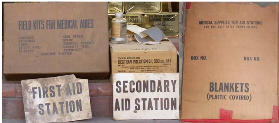
Medical Supplies (Including Dextran, Used to Treat or Prevent Shock) and Blankets.