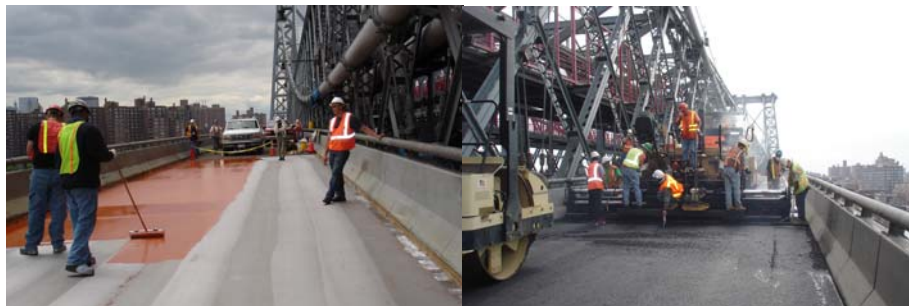
Priming Application and Asphalt Paving Operation on the South Outer Roadway.

The south outer roadway of the bridge was closed on June 1, 2006 for the removal and replacement of the asphalt overlay. Work was completed on the Manhattan side on June 6, 2006, and on the Brooklyn side on June 14, 2006.