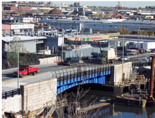
Northeast View of the Metropolitan Avenue Bridge.

In December 2006, New York Construction Magazine selected the reconstruction of the Metropolitan Bridge over the English Kills for an Award of Merit in the Bridge category in the Best Projects of 2006. The award recognizes design and construction excellence, the contribution of key team members and the innovative solutions to a project's challenges.