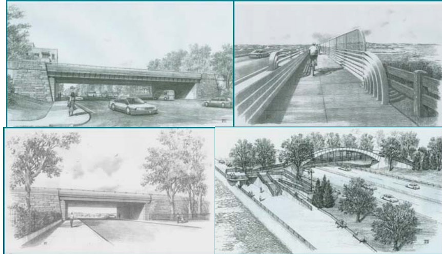
Belt Parkway Bridge Design Renderings.