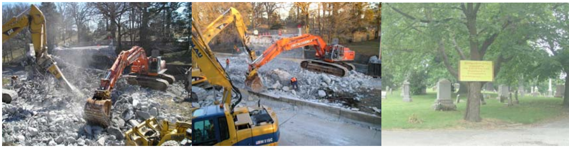
Demolishing the Bridges. New Sign.

The project to demolish these bridges was substantially completed on June 27, 2006.