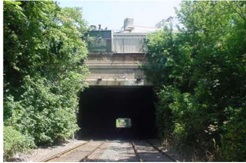
Metropolitan Avenue Bridge over Conrail.