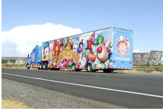
Macy's Overdimensional Exhibit Truck En Route to NYC

On November 23, 2006, Division electricians assisted in the set-up and operation of the Agency Command Van. The NYPD, in coordination with Macy's and OEM, monitored the wind data that was continuously measured at seven locations along the route.