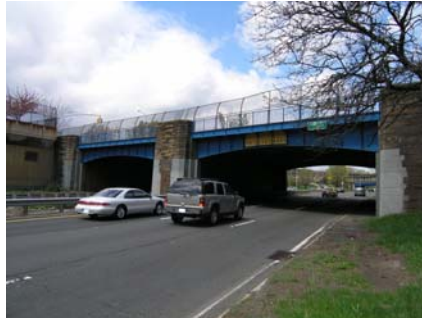
East Tremont Avenue Bridge.

Cleaning and painting of the bridge, which began in August 2006, was completed in November 2006.