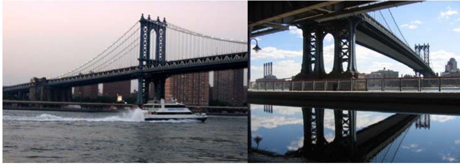
Manhattan Bridge at Twilight. The Bridge And Its Reflection in Ponded Water Under The FDR Drive.