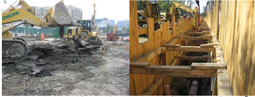
Removing Asphalt and Concrete Roadway. Installing Sewer Between East 165 th and East 166 th Streets.