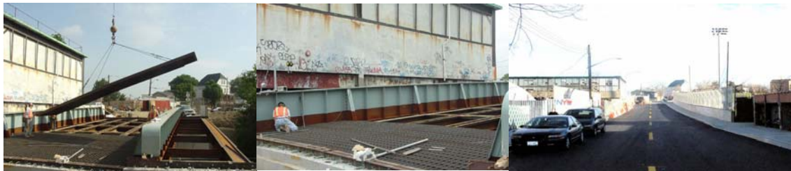
Installation of the Grid Deck. Newly Completed Andrews Avenue Bridge