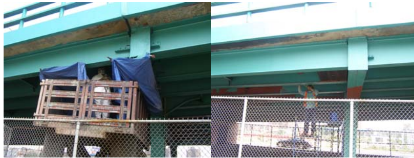
Painting the Harlem River Drive Bridge.

Cleaning and painting of the bridge, which began in August 2006, was completed on November 9, 2006.