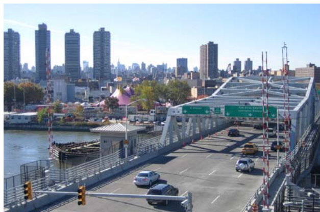
Third Avenue Bridge.

In May 2006, the American Council of Engineering Companies selected the replacement of the Third Avenue Bridge as a National Finalist in the competition for its 2006 Engineering Excellence Awards.