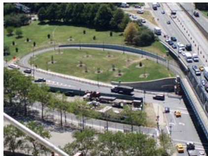
North Bikeway Approach Ramp in Brooklyn.

Effective August 1, 2006, the south walkway was closed to pedestrians until October 9, 2006. For the duration of this closure, the north bikeway served as a shared use facility for both pedestrians and bicyclists.