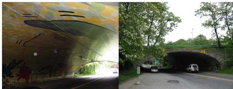
Bronx River Parkway Bridge.

Cleaning and painting of the bridge began and was completed in May 2006.