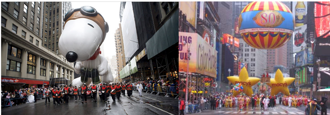
New Flying Ace Snoopy, Macy's 80th Parade Anniversary, and New Pikachu.

To ensure public safety, shortly before the start of the parade during an all day downpour, officials ordered that the balloons be flown at the lowered height of 17 feet, as measured from the midpoint of each balloon to the ground.