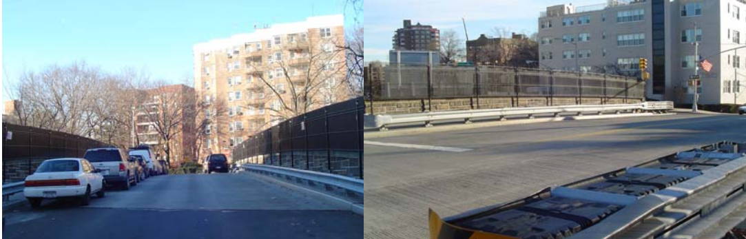
Completed Manhattan College and West 232 nd Street Bridges.

The reconstruction of these bridges, which began on February 23, 2004, was substantially completed on September 28, 2006.