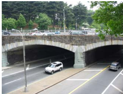
Southern Boulevard Bridge.

Cleaning and painting of the bridge began and was completed in May 2006.