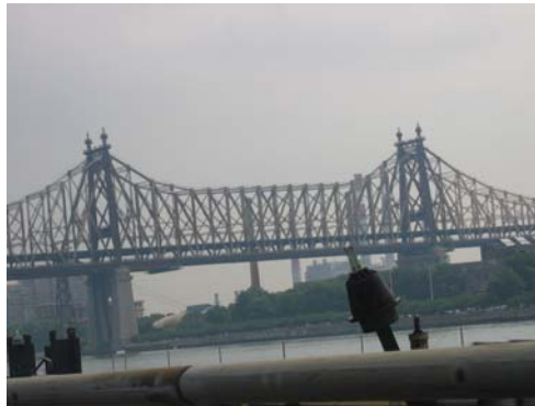
Queensboro Bridge.

March 30, 2006 marked the 97 th anniversary of the opening of the bridge.