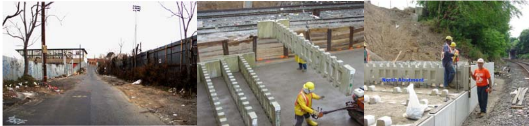
Andrews Avenue Bridge Prior To Reconstruction. Installing Pre-Cast T-Wall for the Modular Abutments. Constructing the Third Level of the Pre-Cast Abutment.

properties, and enabled installation of the precast units in a relatively short time, even in winter. Precast wall units also improved the aesthetics of the playground and the area within the project limits. The use of precast concrete modules assured better quality concrete, and ease of installation reduced the total construction time from 15 months to 9 months. The use of weathering steel for bridges over railroads eliminates expensive costs involved in maintenance painting. This project was substantially completed on February 1, 2005.