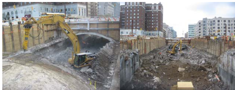
Demolition of the Bridge. Removing Debris From the Bridge.

Stage II reconstruction of the bridge began on October 26, 2006. The underpass was closed to traffic as part of this stage, which will be in place through April 1, 2007.