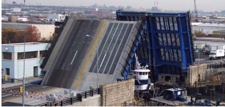
Tugboat Pushing a Barge Under the Open Metropolitan Avenue Bridge.