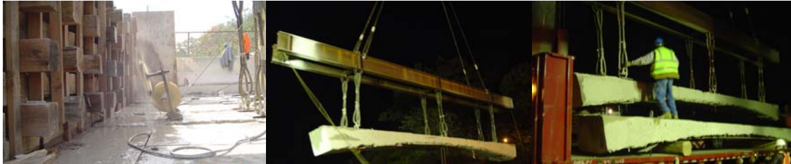
Cutting and Removing the Existing Bridge Sections Over the Parkway.

The removal of the existing bridge sections over the northbound Henry Hudson Parkway was performed at night on October 25 and 26, 2006. The removal of the sections over the southbound Henry Hudson Parkway was performed at night on October 31 and November 1, 2006.