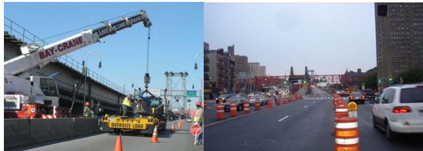
Removing the Brooklyn Approach Barrier. New Rush Hour Traffic Pattern on the Williamsburg Bridge.

In order to help minimize the impact of Manhattan-bound traffic after the closure of the Manhattan Bridge lower roadway, beginning October 16, 2006 two additional lanes were made available on the Williamsburg Bridge (except for trucks and buses) from 6 AM to 10 AM Monday to Friday by reversing the south inner roadway. These two traffic lanes only accommodate traffic directly to southbound Allen Street.