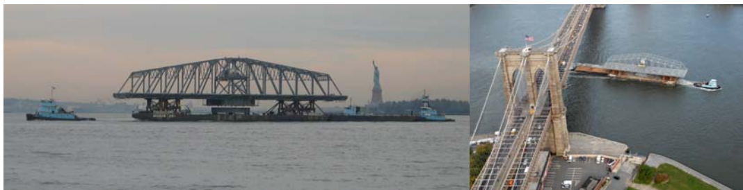
New 145 th Street Bridge Span Passing the Statue of Liberty. Passing the Brooklyn Bridge.

The barge carrying the new swing span arrived at the Third Avenue Bridge site on October 31, 2006.