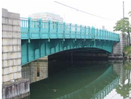
Cropsey Avenue Bridge

Cleaning and painting of the bridge, which began in September 2005, was completed on September 6, 2006.