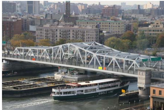
Tour Boat Passing Under the New Third Avenue Bridge.

The reconstruction of this bridge, which began in July 2001, was substantially completed on November 14, 2006.