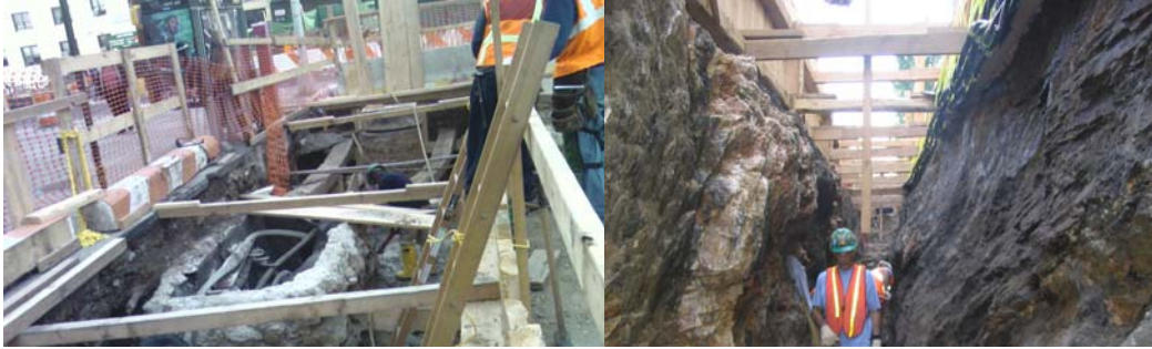
Grand Concourse Bridge: Demolition of Existing Con Ed Vault. Backfill and Compaction of Sewer Manhole.