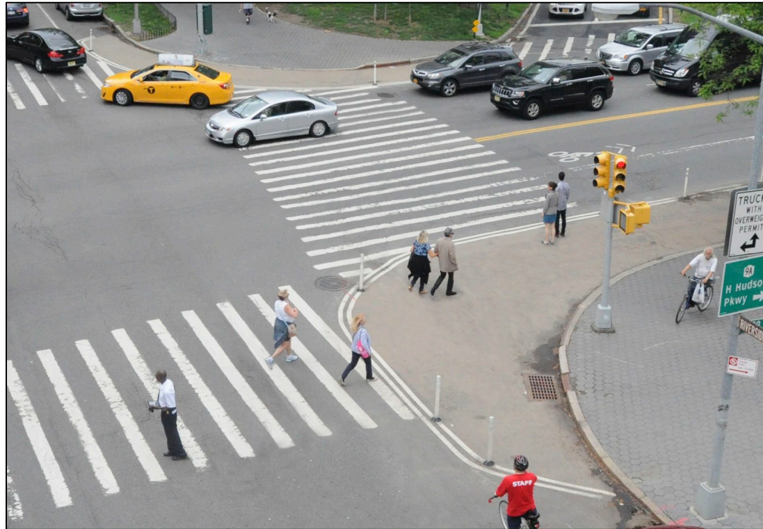
Similar Configuration: Riverside Dr, Manhattan