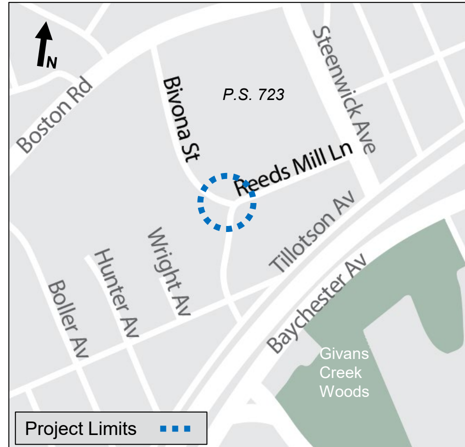
Bivona St and Reeds Mill Ln