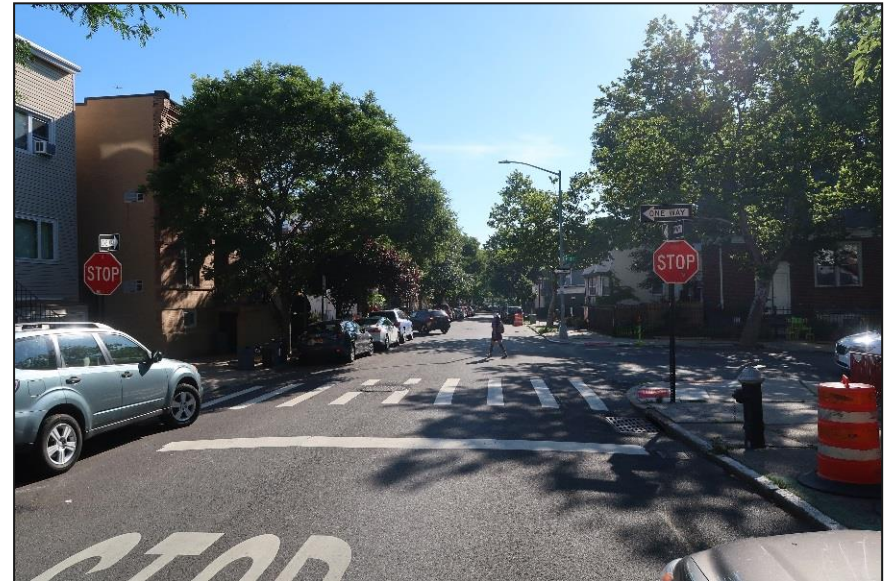
Before: Vanderbilt and E 3 rd St