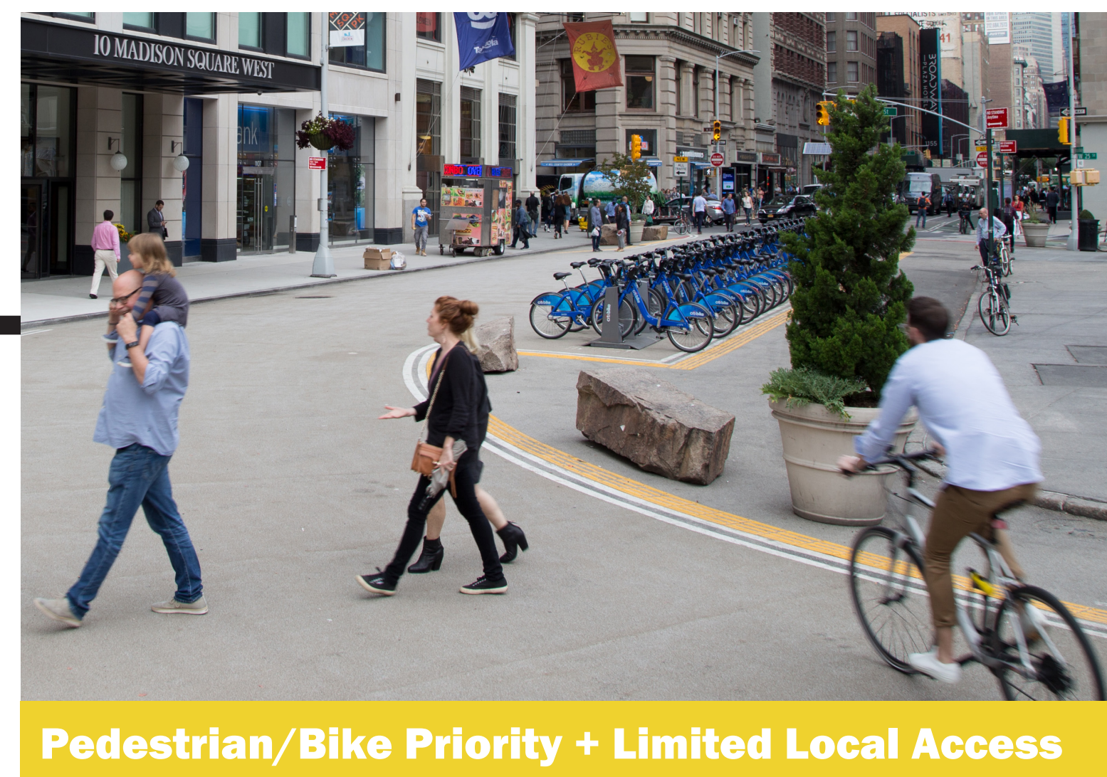
Pedestrian/Bike Priority + Limited Local Access