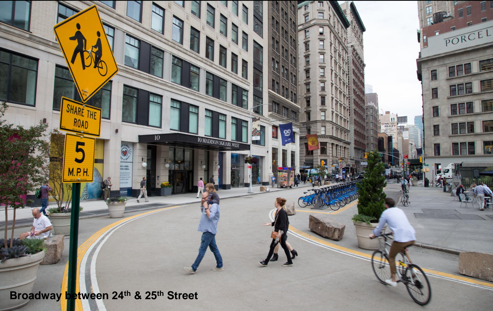
Broadway between 24 th & 25 th Street