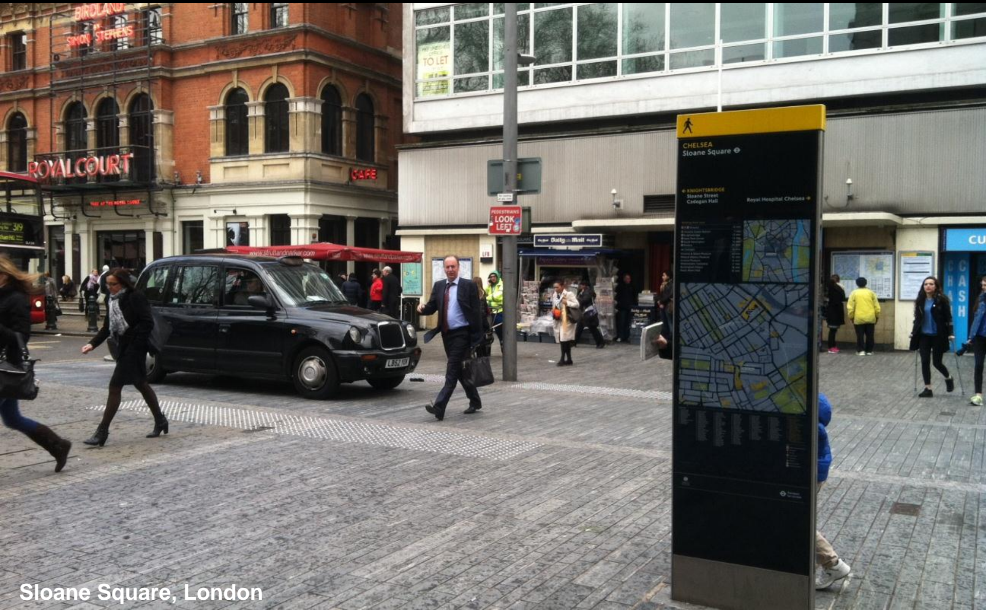
Sloane Square, London