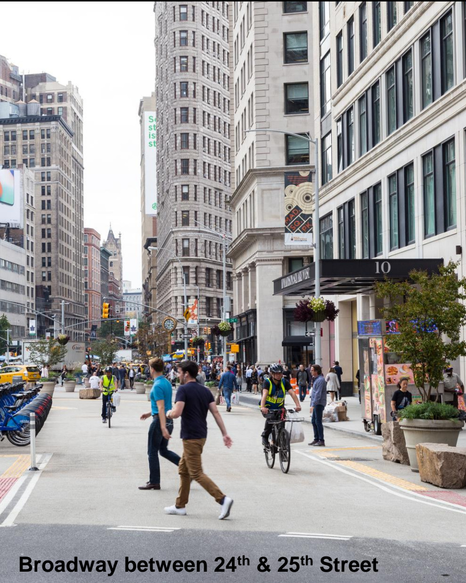
Broadway between 24 th & 25 th Street