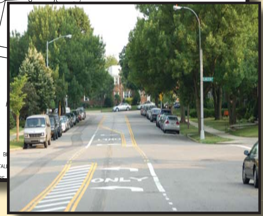
Above: Marking plan for entire 263 rd Street corridor. Right: Example of turning bays and new roadway alignment.