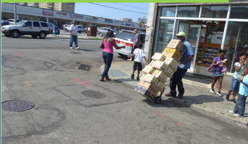
Substandard sidewalk facilities