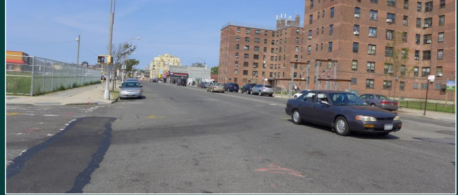
54 % of vehicles traveling over speed limit