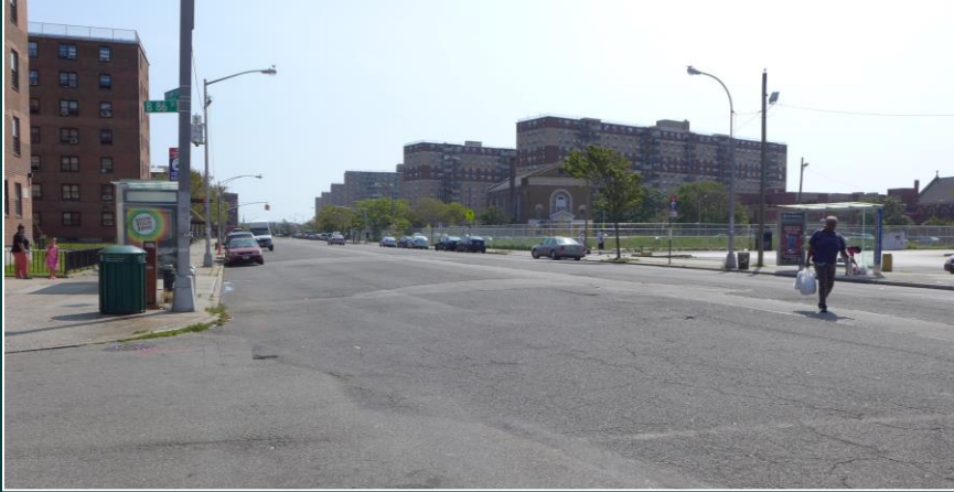
Long crossing distances