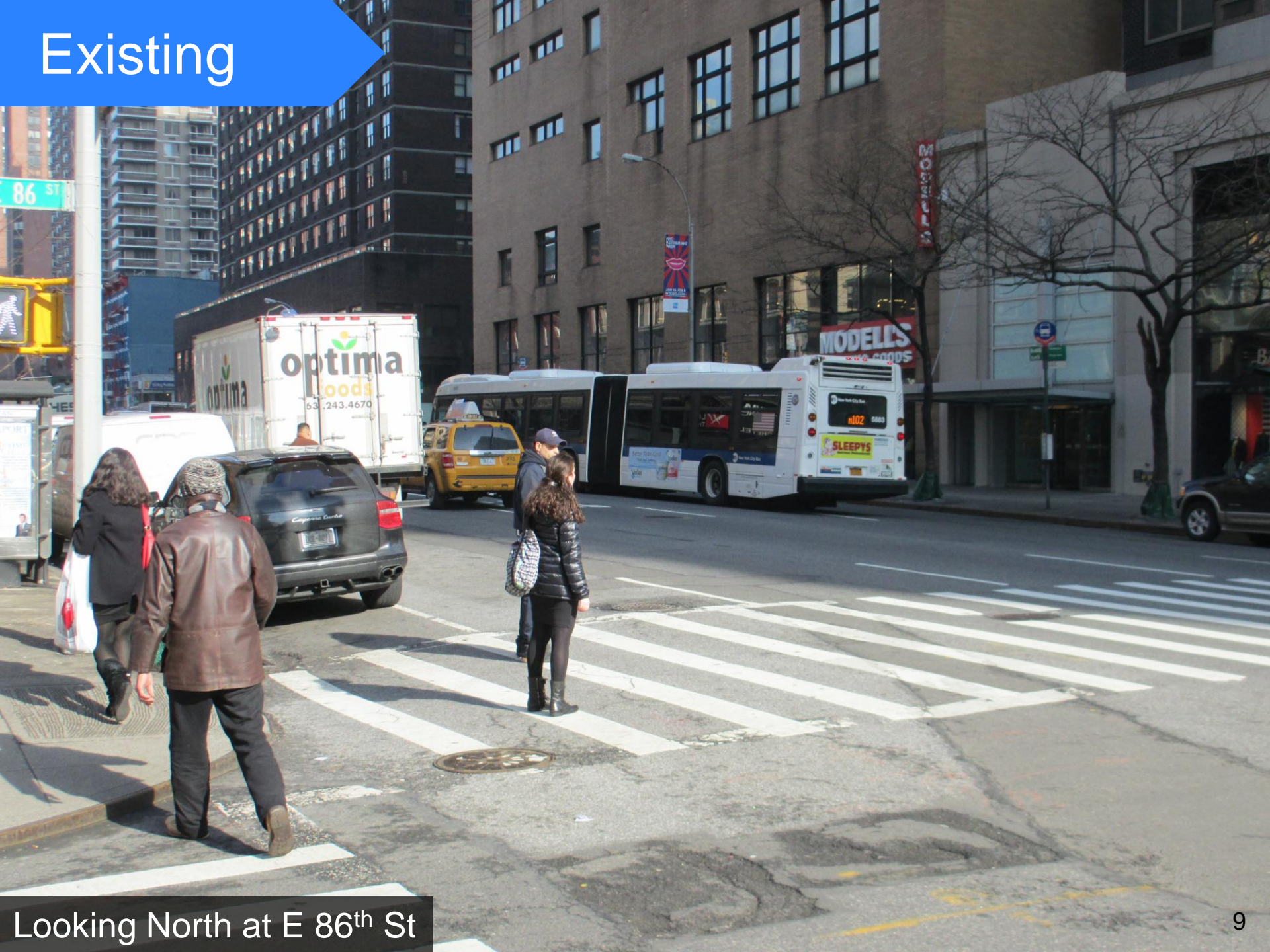
Looking North at E 86 th St