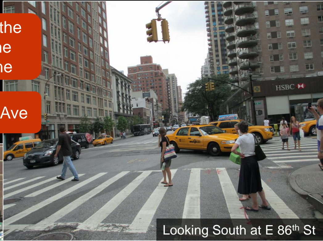
Looking South at E 86 th St