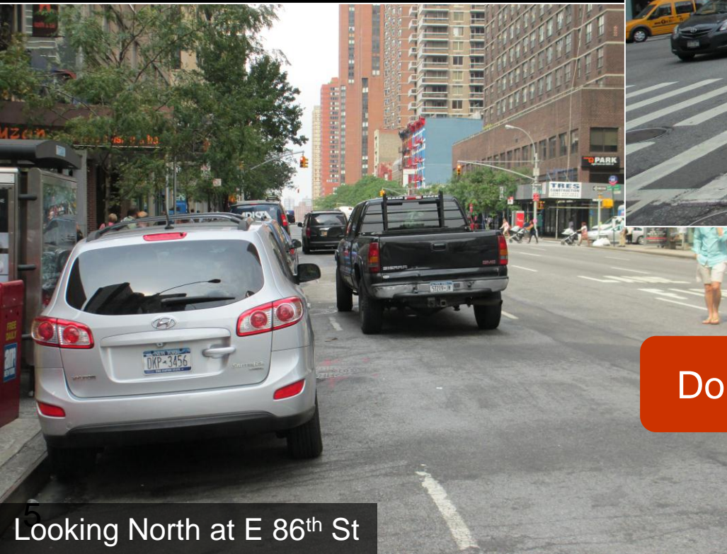
Looking North at E 86 th St