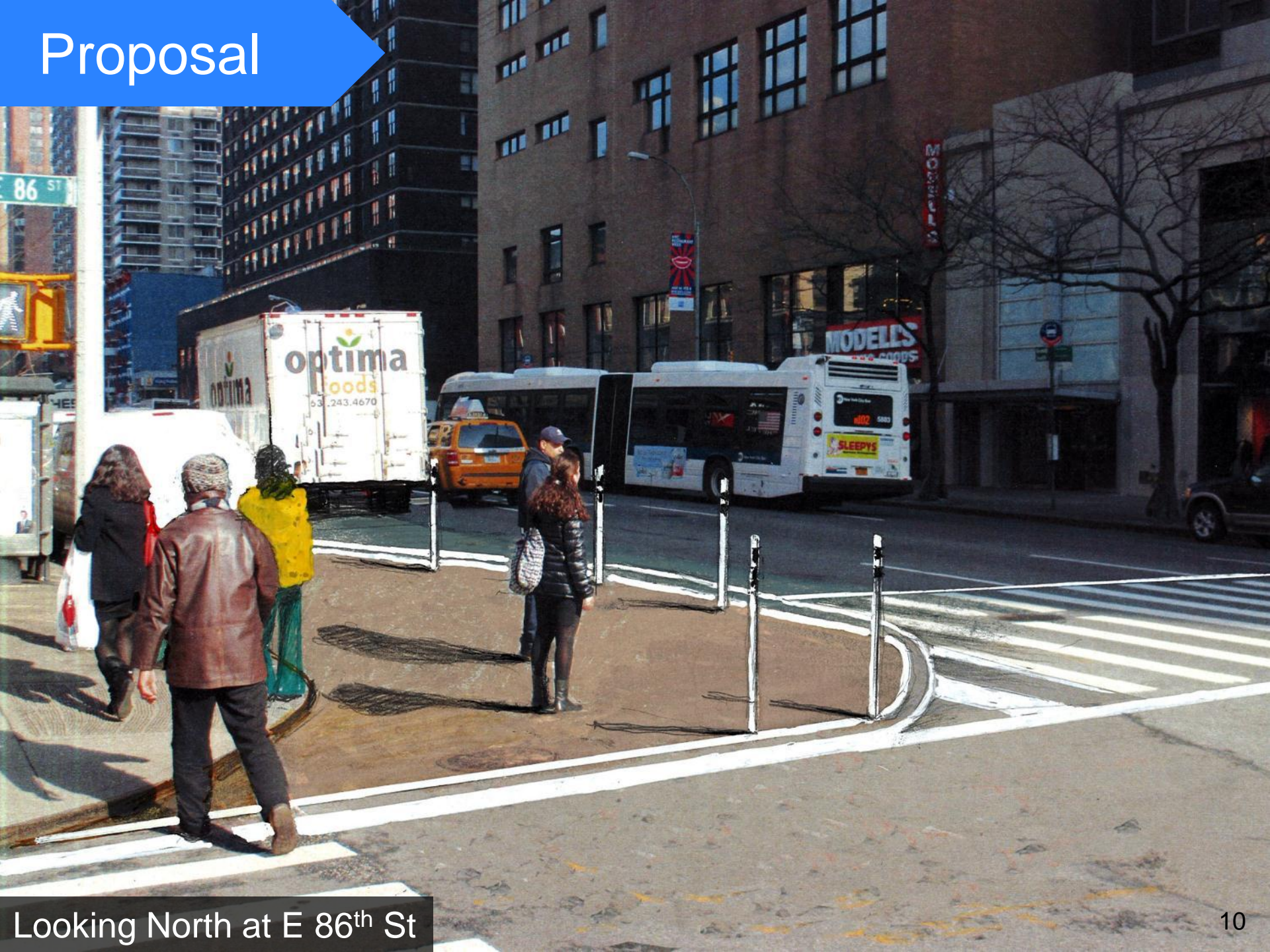
Looking North at E 86 th St