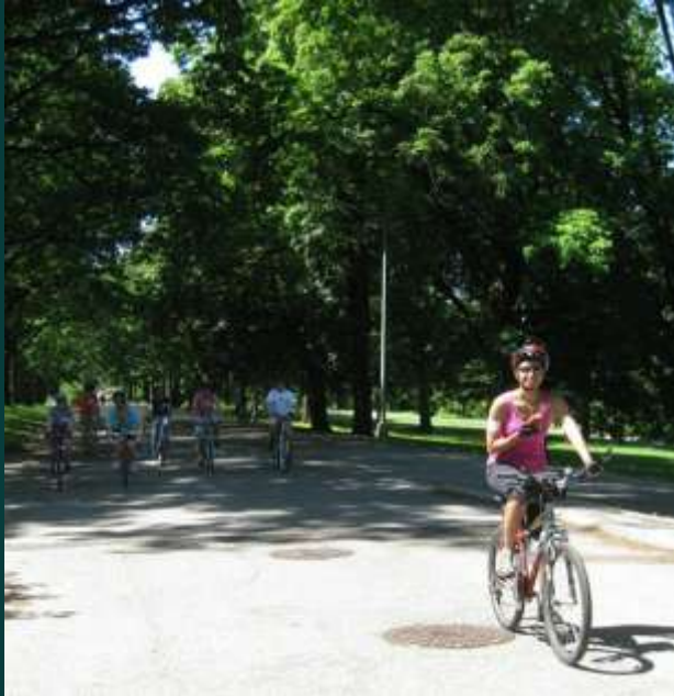
Bronx River Greenway Shoelace Park