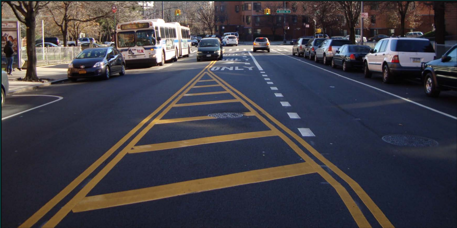
Proposed Configuration: E 180 St, Bronx