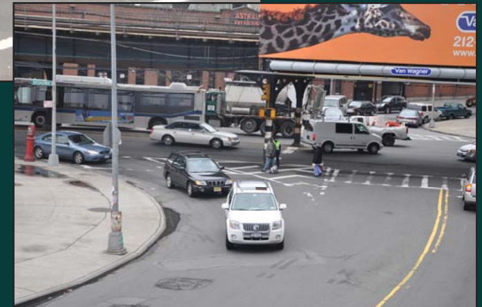
Heavy truck and bus volume