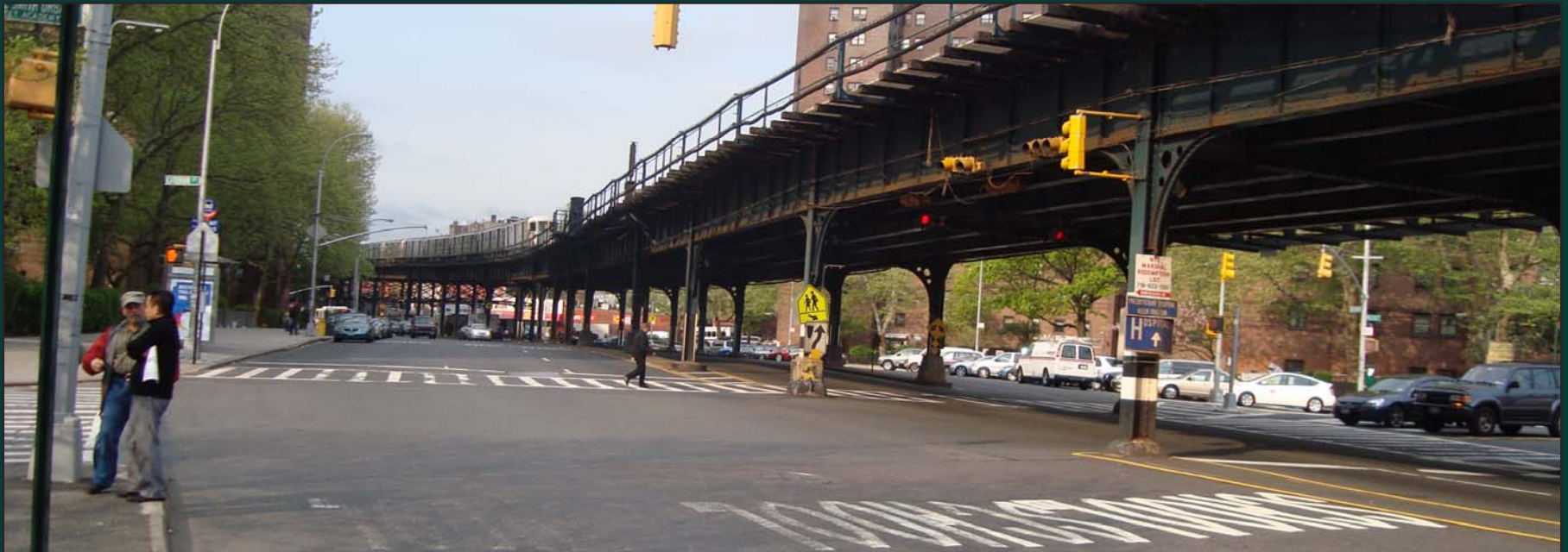
South crosswalk, east side