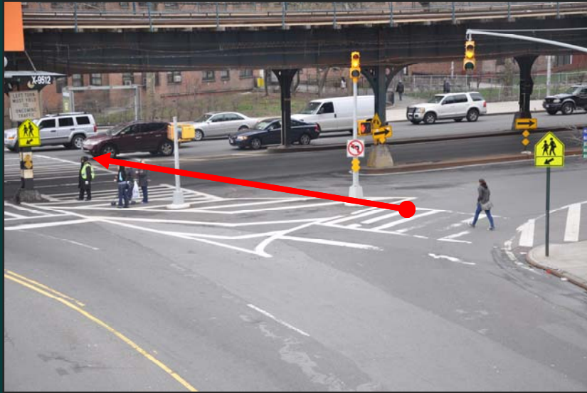
Long crossing distances