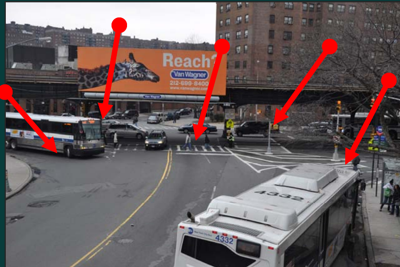
Multiple vehicle/pedestrian conflict points