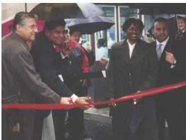
Officials from the NYC Department of Business Services, the Department of Juvenile Justice and the Pitkin Avenue BID Cut Ribbon in Brownsville.

More than 1,500 gallons of paint plus brushes, roller sleeves, poles, paint trays and drop cloths were donated by The Home Depot.