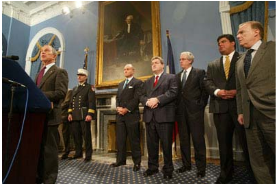
Mayor Bloomberg with commissioners at 2002 public safety press conference

In summing up his administration's overall public safety accomplishments, Mayor Bloomberg said "In 2002, we have made our public safety agencies more efficient and gotten better results while spending less money. Not only have we done more with less, we have done quite well with less."