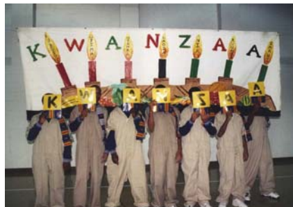
DJJ youth celebrate Kwanzaa

ber 12 th . For each of the ensuing seven days, each participant was required to perform a kind deed or gesture toward their "Kringlee." Speculation and random guesses were abundant as participants labored to identify who their "Kringler" was, while trying to hide their identity from their own "Kringlee." The week long event culminated in the opening of small gifts participants received from their respective Kringlers.