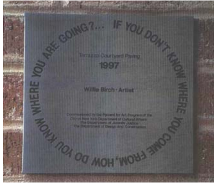
One of two artworks photographed and included in the City Archives.

The City Arts Commission visited Crossroads on August 6 th to photograph works of art by Carlton Ingleton and Willie Birch to place in the City's archives. Ingleton's 'The Spirit of Love,' commissioned in 1997 by the Percent for Art Program of the NYC Department of Cultural Affairs, the Department of Juvenile Justice and the Department of Design and Construction, is a large, multi-media work currently on display within the facility, greeting residents, staff and visitors upon entry. The Arts Commission also photographed artist Willie Birch's 1997 mural titled 'If you don't know where you come from, how do you know where you are going?' The mural is painted on the hard surface in the facility's main courtyard. Both works have been on continuous display at the facility since it opened in 1998.