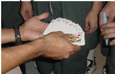
David Blaine performs at Bridges

Residents immediately recognized Blaine from his TV specials and asked probing questions, seeking to determine if he is a highly skilled illusionist or if he truly can conjure up forces of magic. Blaine let them judge for themselves.