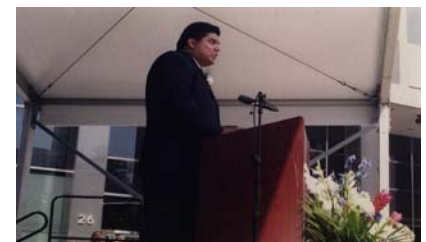
DJJ Commissioner Hernandez speaks at ceremony honoring Federal employees.

Central Office were the creation of a memorial blanket with images representative of the courage and services rendered on September 11, 2001, the erection of a wall of remembrance, creation of a memorial garden, and essay and poetry contests.