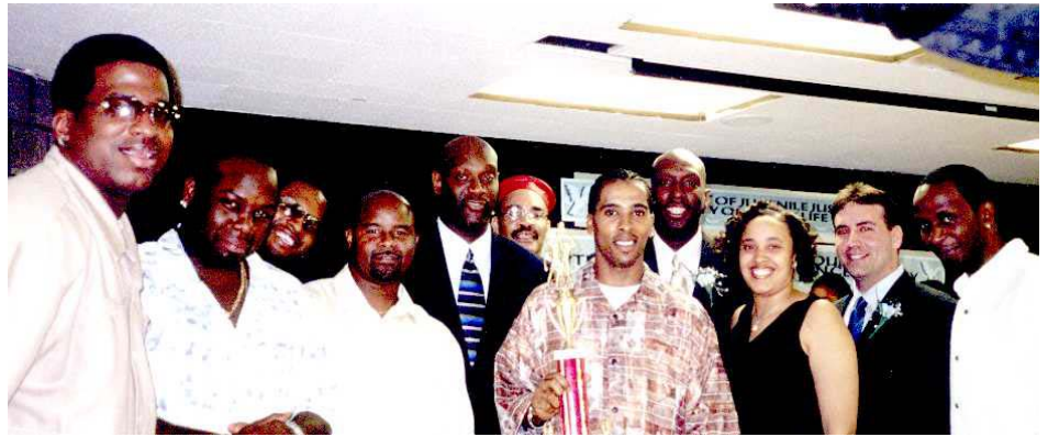
DJJ's 2002 basketball championship trophy is awarded to Horizon Juvenile Center.