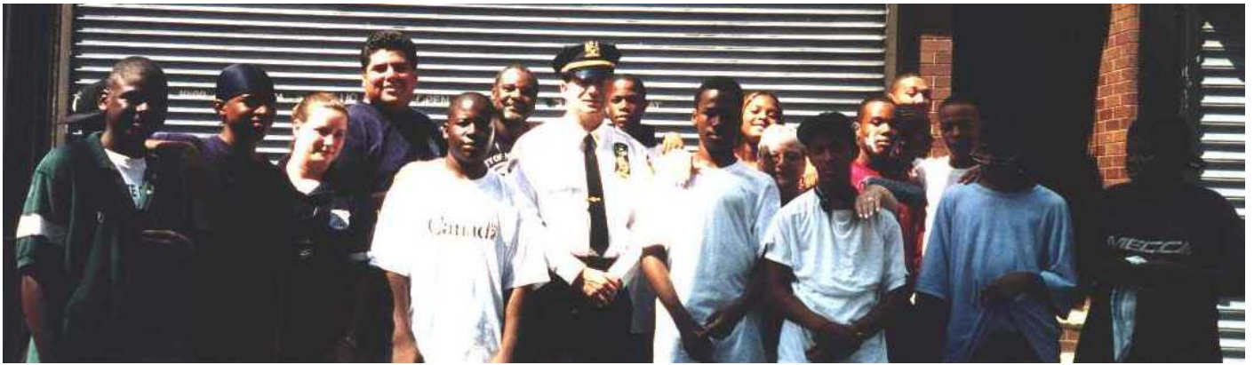
CBI youth assist Mayor Bloomberg's anti-graffiti initiative, painting storefronts along New Utrecht Avenue in Brooklyn.

and assisted the youth in painting storefront gates.