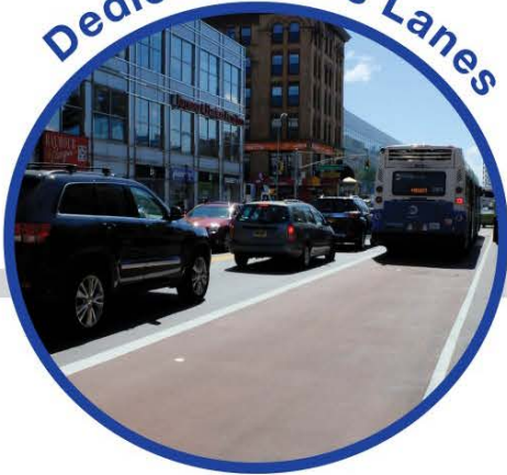
Dedicated Bus Lanes