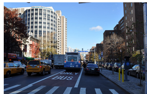
Dedicated bus lanes with lengthened bus stops for easier curb access