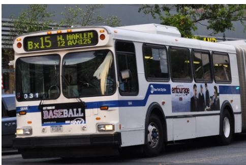
Bx15, M100, M101, and Q19 continue to serve all local stops