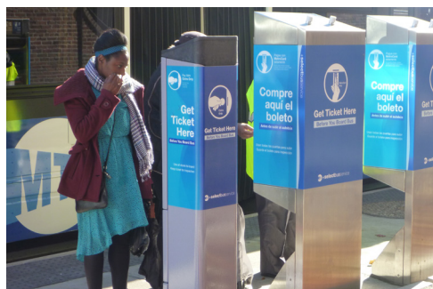
Off-board fare payment machines for faster boarding