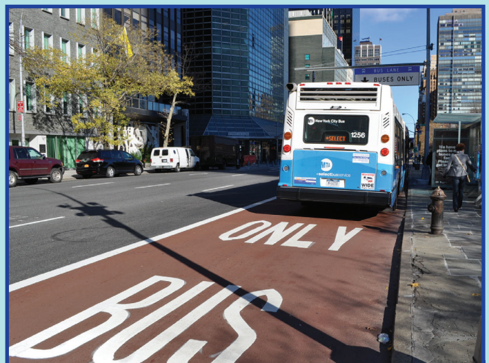
M15 SBS on First Avenue

DOT and NYCT hope to achieve similar results on Nostrand and Rogers Avenues.