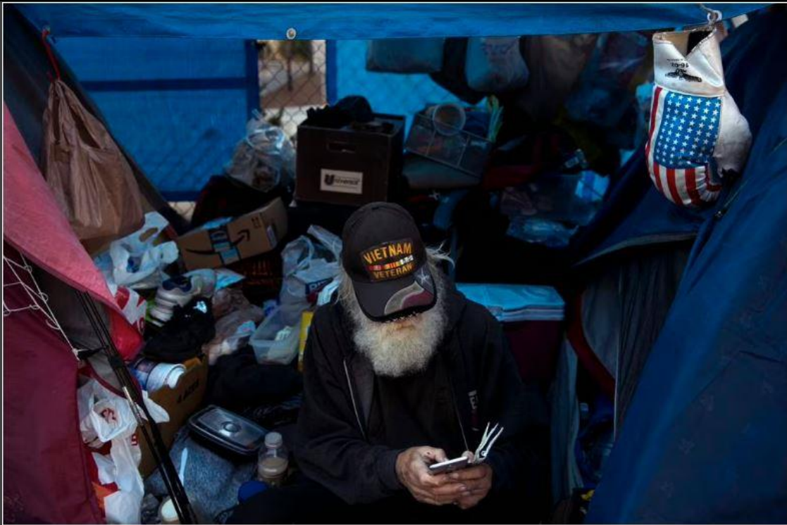
A homeless Vietnam War veteran passes time in his tent set up in downtown Los Angeles on Dec. 1, 2017.