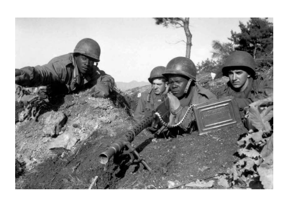
Military.com | By Blake Stilwell

Bob Marley first sang about Buffalo Soldiers in 1983, a little less than 120 years after the actual Buffalo Soldiers were formed in the U.S. <u>Army</u>. Marley's song accurately depicts their story as a fight for survival in the prejudiced Army of the time period, but they also fought to survive the harsh conditions of the frontier, conflict with native tribes and Wild West outlaws as they sought to maintain law and order and protect settlers.