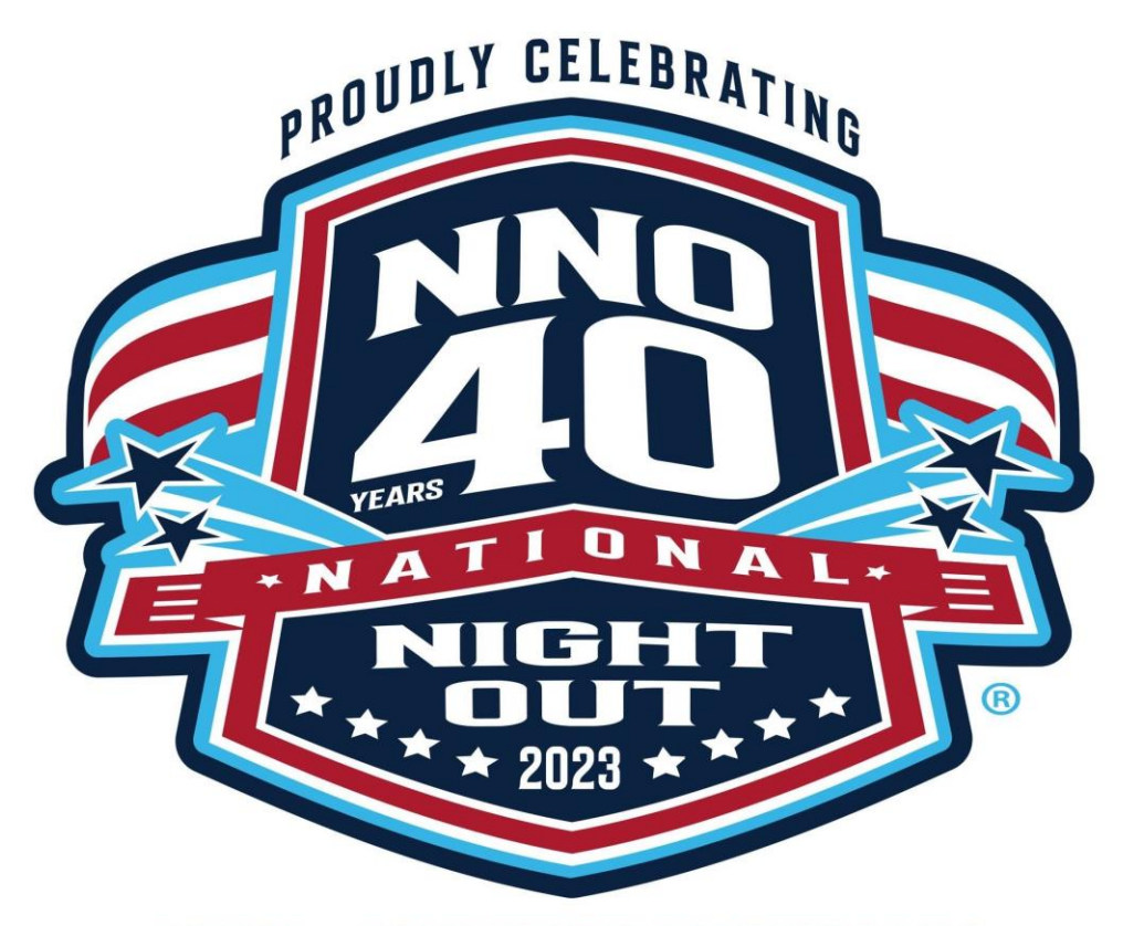
POLICE • COMMUNITY PARTNERSHIPS

Join the NYPD and city officials at more than 70 locations citywide on National Night Out Against Crime, Tuesday, August 1<sup>st</sup>, 2023.