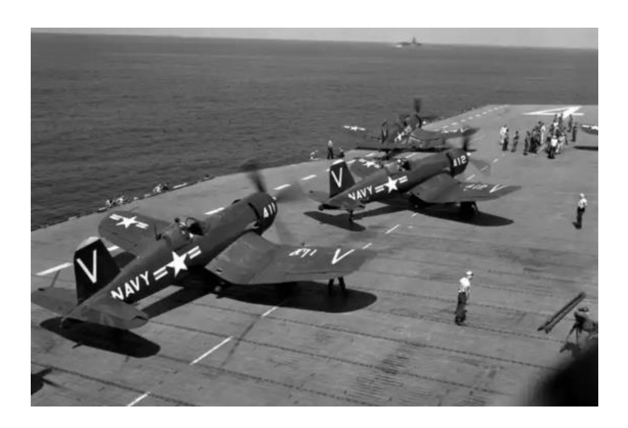
July 24, 2023 | By <u>David Vergun</u>, DOD News

On June 25, 1950, North Korean forces crossed the 38th parallel and attacked South Korea. Three days later, North Korean forces captured South Korea's capital, Seoul.