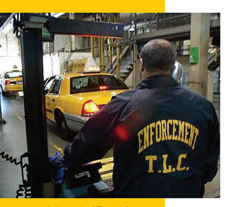
An Inspection Officer performs an emissions test on a NYC taxicab.

compliance rate, an improvement of 1% over last year's compliance rate of 92% when the initiative was first introduced. In addition, USB worked closely with Constituent Affairs as well as Licensing and Standards on the for-hire vehicle rules