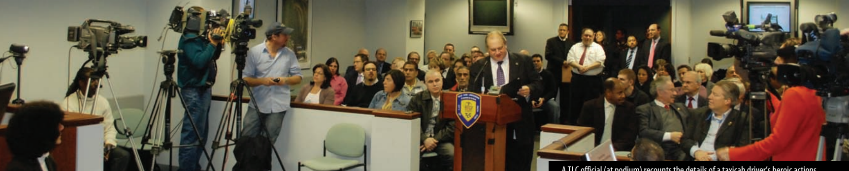
A TLC official (at podium) recounts the details of a taxicab driver's heroic actions.