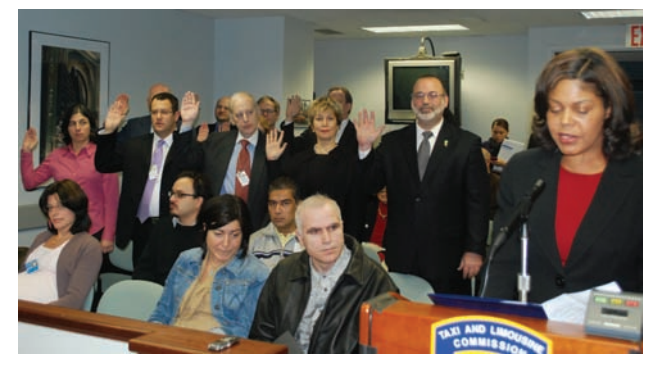
TLC's Chief Administrative Law Judge (at right) administers the Oath of Office to a new class of judges.

A total of 83.545 summonses were adjudicated in 2009 by the Taxi and Limousine Commission's Administrative Tribunal, covering 93,329 violations. Over 5,200 appeals decisions were issued and 17 new Administrative Law Judges were appointed and given extensive training. The Division introduced teleconferencing between the TLC's Staten Island satellite office and Long Island City's Adjudications facility, which allows respondents who received summonses to hold hearings at the Staten Island office rather than make a personal appearance at the TLC's Long Island City location. In 2009, Adjudications conducted 1,645 consumer complaint hearings via teleconference