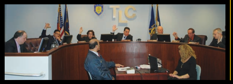
The TLC Board votes at a recent public meeting.

The TLC holds regularly scheduled public meetings where regulatory actions are discussed and publicly heard, base license applications are reviewed, and staff deliver presentations on new and proposed policies, pilot programs, and regulations. In 2009, the TLC promulgated seven rulemaking actions. A few examples include regulations that will enhance safety and customer service in the for-hire vehicle industry, and banning use of portable electronic devices by drivers. This report contains a calendar of the specific actions taken at Commission meetings during this past year.