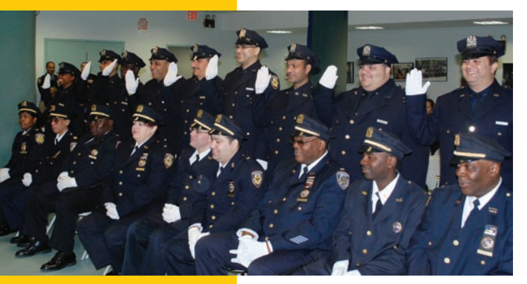
The TLC swears in another class of New York's Proudest.