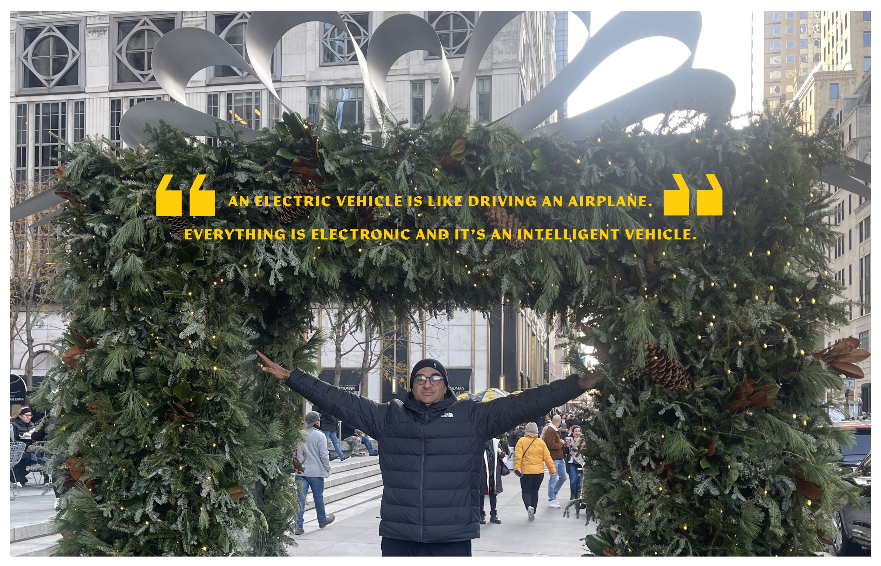
FHV driver Moyaluna appreciates the safety features and fast charging of his EV