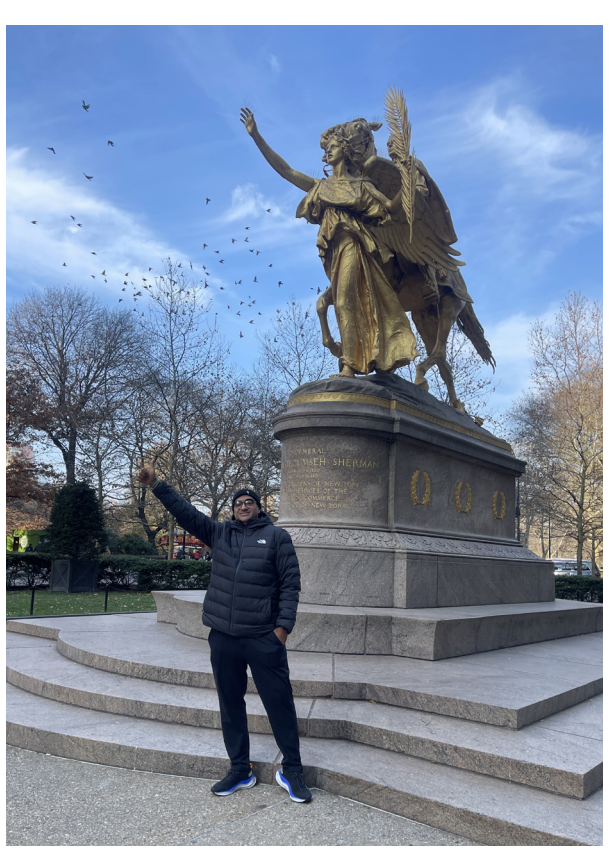
TLC's Office of Community Affairs met Moyaluna in Midtown Manhattan

The only complaint that I have – though not about the vehicle but rather on the city – is that there are very few EV charging stations.