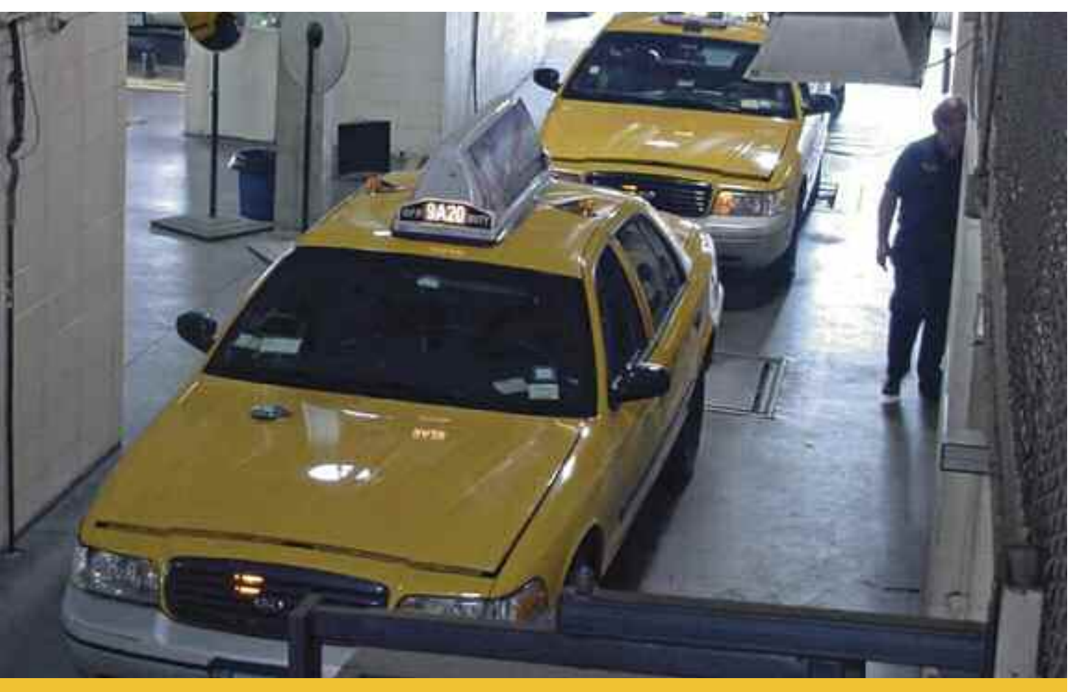
The TLC's state-of-the-art inspection facility is now certified by the NYS DMV.