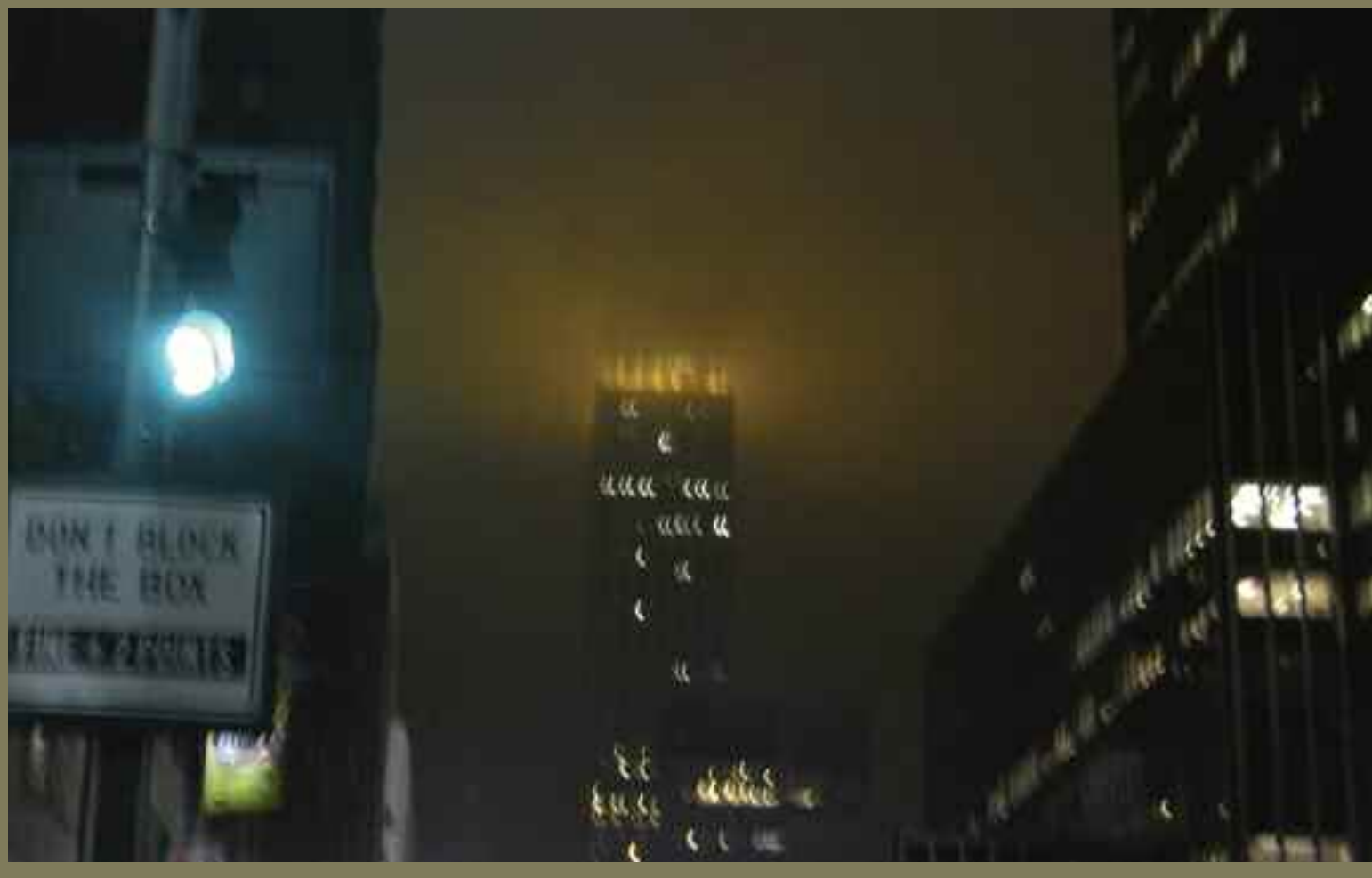
The Empire State Building was bathed in yellow to commemorate the Taxicab's Centennial.