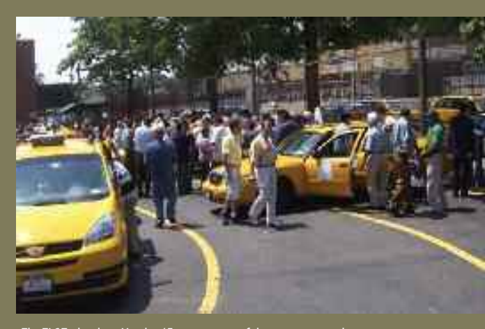
The TLC Technology Vendors' Expo was one of the many outreach events to familiarize the taxi industry with the T-PEP technology and help it make fully informed decisions about which vendors to work with.