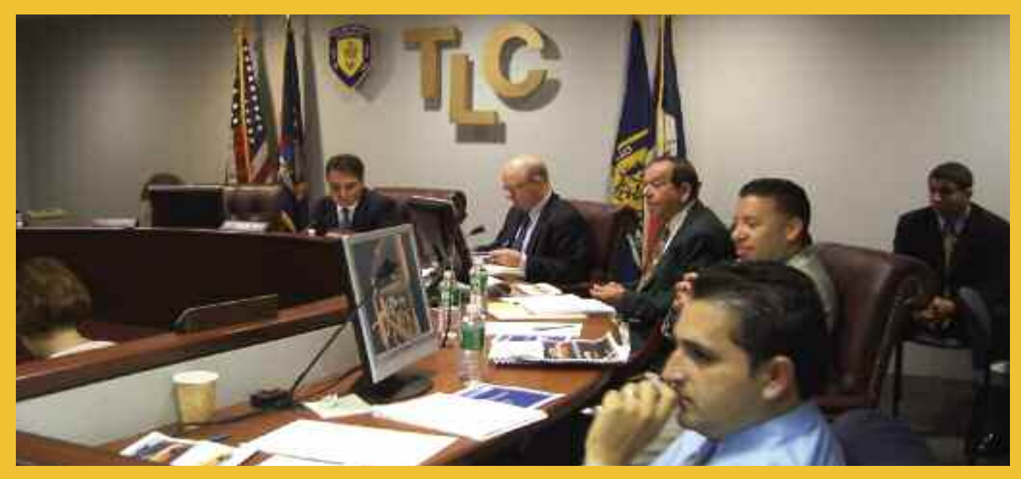
The Taxi and Limousine Commission meets monthly.