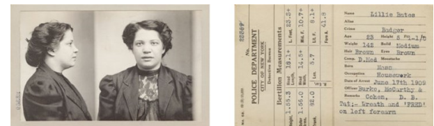
One of the 3,000 Bertillon "mug shot" cards from the NYPD Photo Unit collection.

Access posts from all New York City agencies through the searchable archive.