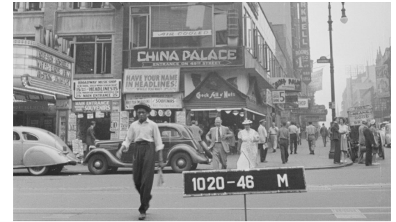
A 1940s tax photo image.

The Municipal Library, established in 1913, is the official depository for all city agency publications. Use our online catalog to search for publications from the 17 th century to the present, organized by title, author, and date of publication.