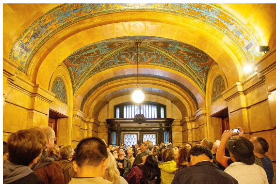
Visitors touring the Hall of Records.

DORIS regularly hosts a variety of interesting in-person and virtual public programs, tours and exhibits on our city's unique history. View treasures from the collections and learn more about the City's history.