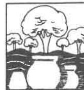
Whitepot Settled 1653